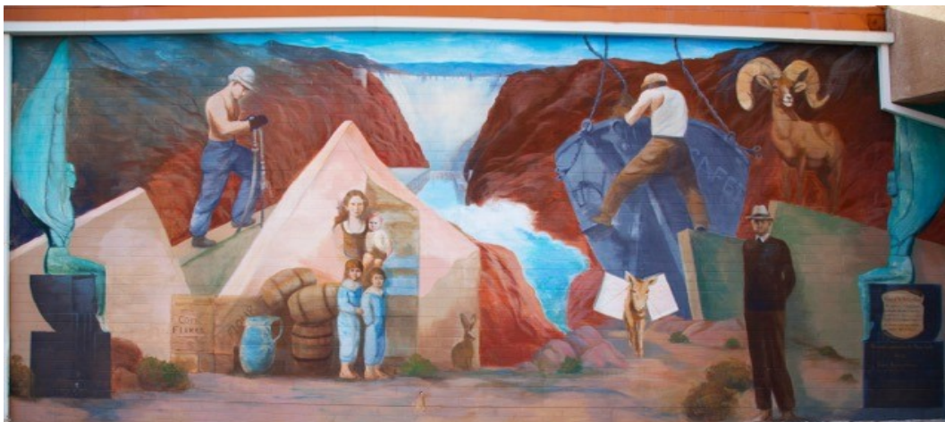
Mural: History of Boulder City