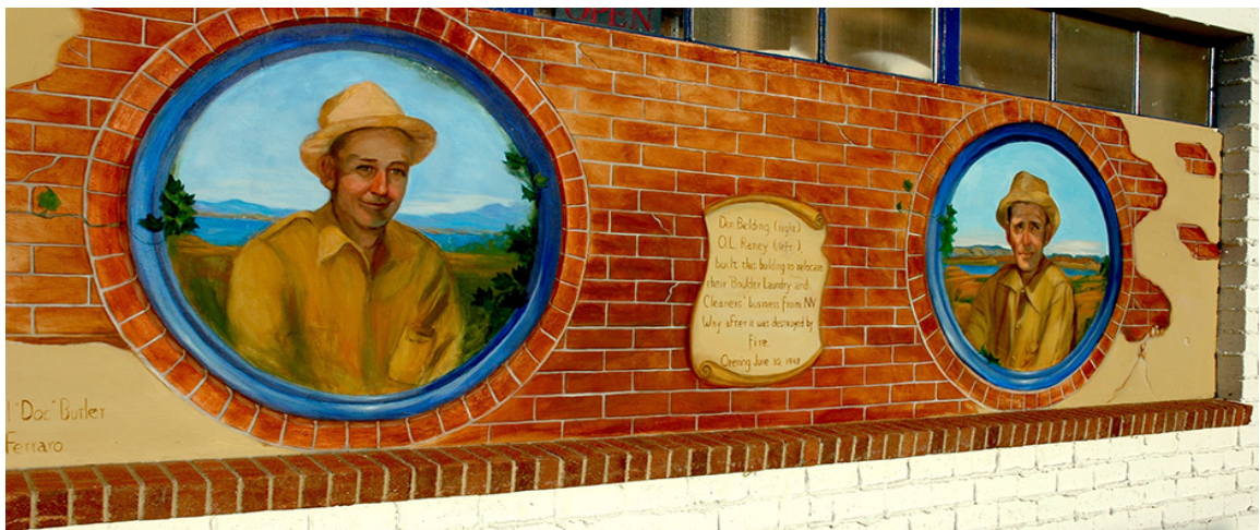
Mural: Goat Feathers Emporium Mural #2

History: These murals depict the pioneering spirit and introduction of business to Boulder City. Construction of housing exploded in 1932 as the federal government, by way of the Bureau of Reclamation, began building homes for the laborers. Homes went up so quickly it was not uncommon for a man to return after work and walk into the wrong house. With new homes came new businesses. Many of the workers remained after the Hoover Dam was built and opened businesses as the economy stabilized. This building was built in June of 1948 after a fire destroyed the original Boulder Laundry and Cleaners on Nevada Way.