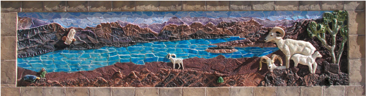
Mural: Lake Mead Mural