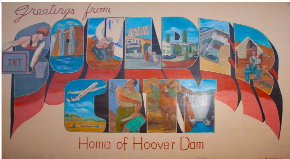
Mural: Greetings from Home of Hoover Dam

History: Mural illustrates a landscape scene of Boulder City. It was built on federally owned lands by the government in the early 1930s as part of the Boulder Canyon Dam Project. Once built, it was overseen by a single U.S. Bureau of Reclamation employee with the ability to evict anyone for any reason. Alcohol and gaming were strictly prohibited. It took 30 years for the residents to be released from government rule. Once on their own, they quickly incorporated Boulder City in 1960 and built a mecca of adventure and culture.