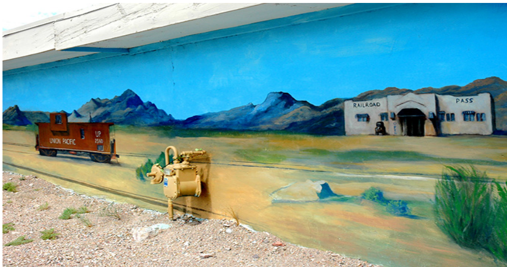
Mural: Train – section 2