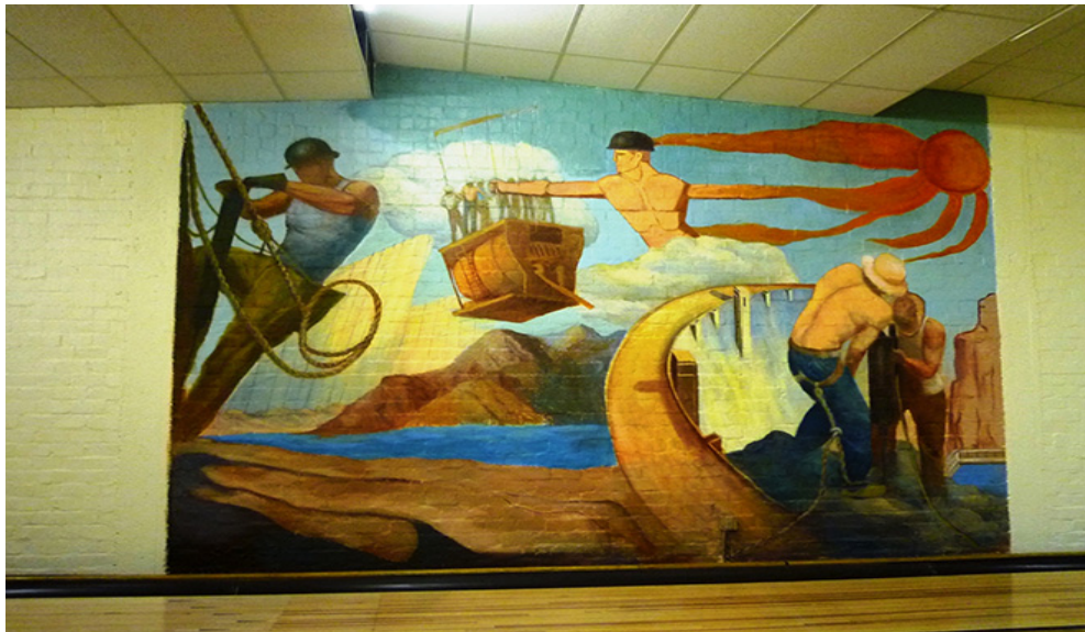
Mural: Spirit of Hoover Dam