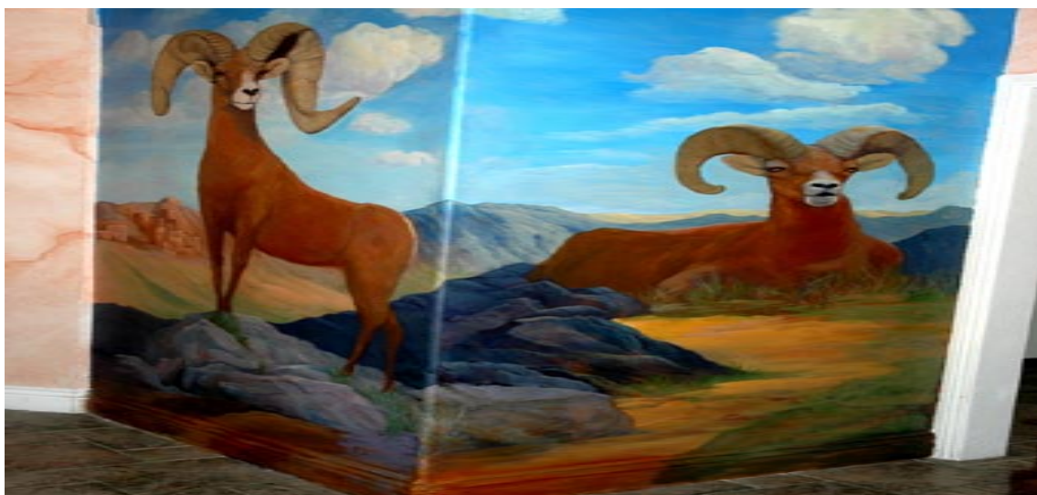
Mural: Big Horn

History: This mural is of our desert beauty, the abundant wildlife and local mascot, the Big Horn Sheep, all found in and around Boulder City. Bighorns can weigh up to 300 lbs. and their horns up to 30 pounds.