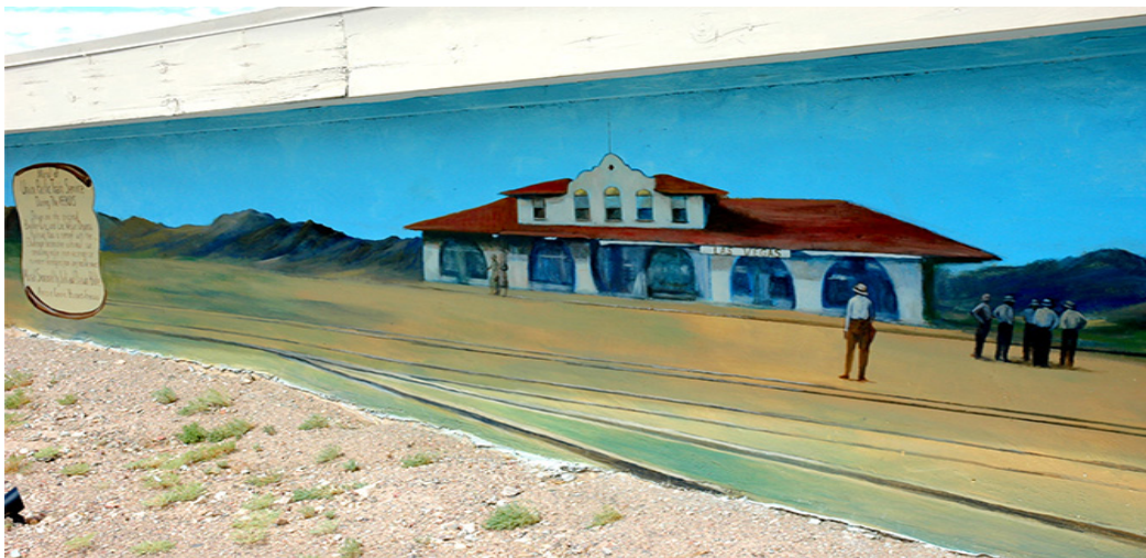
Mural: Train – section 3

History: Unique among railroads, this stretch of railroad tracks was built by the federal government, Union Pacific, and a private contractor explicitly for the purpose of transporting stone, sand and other materials to the Boulder Canyon Dam Project. Originally comprised of three railroads, they were often referred to as the US Government Construction Railroad or the Hoover Dam Railroad. The three rail lines operated daily from 1931 until the end of the Dam project in 1935.