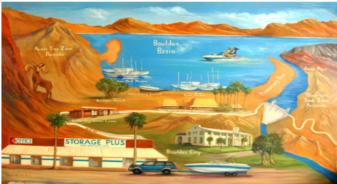
Mural: Storage Plus