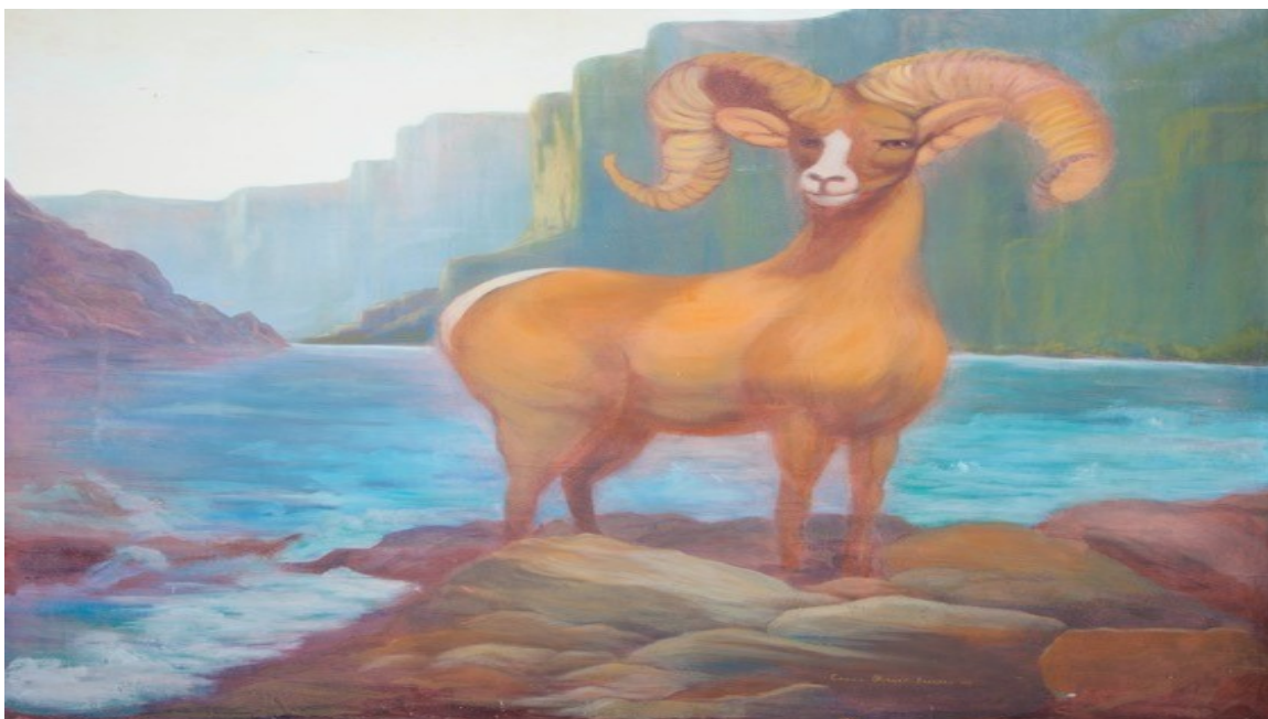
Mural: Big Horn Sheep