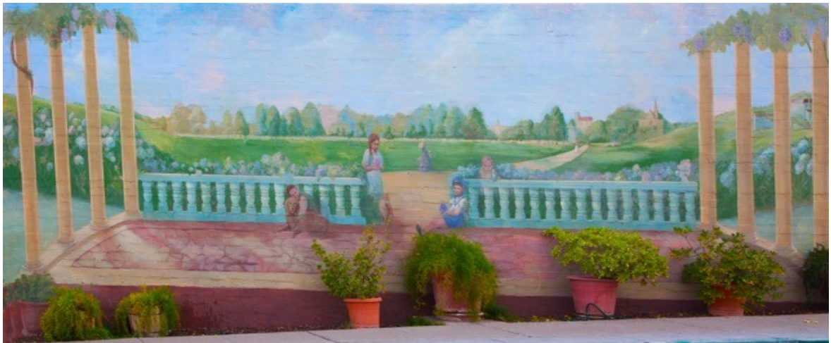
Mural: Park with Columns