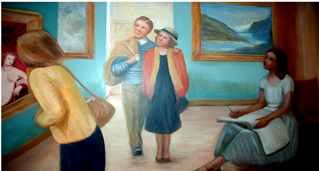
Mural: The Museum – section 4

History: A mural hinting the Boulder Dam Museum is housed within the Boulder Dam Hotel. Its interactive exhibits walk you through the daily lives of those that created the Dam against staggering hardship.