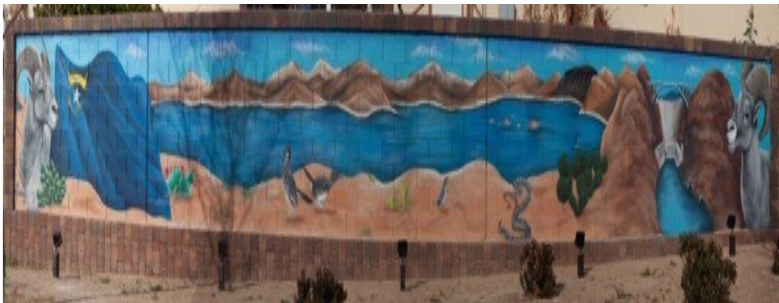
Mural: Lake Mead Mural

History: Boulder City today is home to adventure, history and culture while offering a quaint and charming hometown atmosphere.