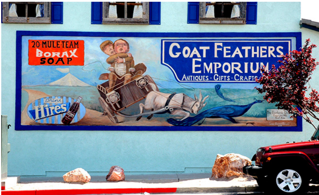
Mural: Goat Feathers Emporium Mural #1