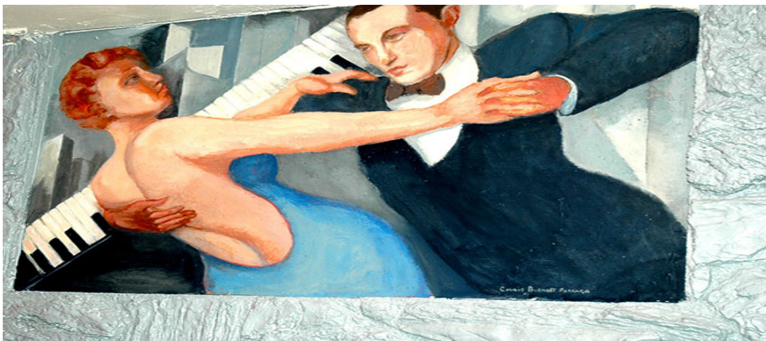
Mural: Art Deco Mural #3