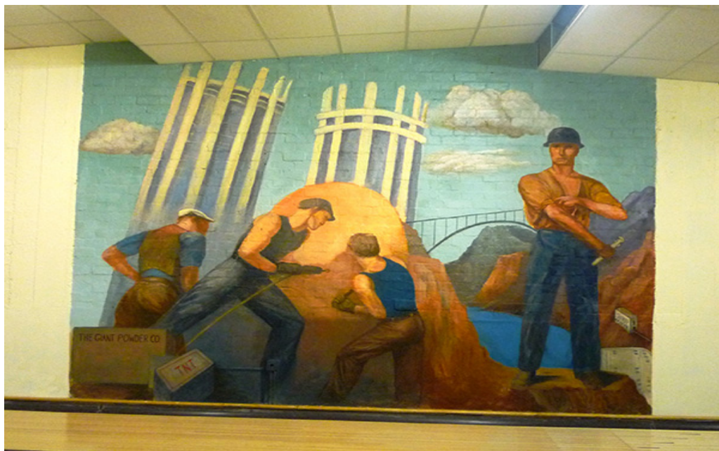
Mural: Men at Work on Hoover Dam

History: Construction on the Boulder Dam began in 1931, during the Great Depression when work was scarce and men desperately searched for employment. Word of possible openings drew as many as 20,000 hopeful workers to the area.