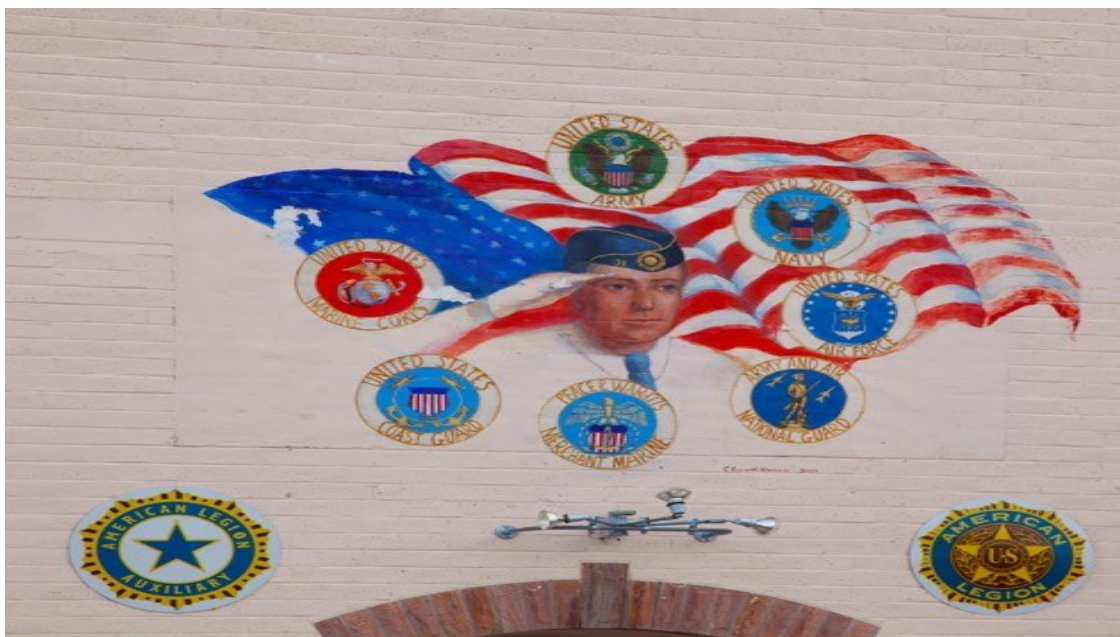
Mural: Salute to All Veterans

History: These murals reflect a lifestyle shared with family, friends and history cherished by Boulder residents. Boulder Bowl, its historic bowling alley featuring eight lanes, over-lane ball returns and original wooden seats was seen on the History Channel's "American Restoration."