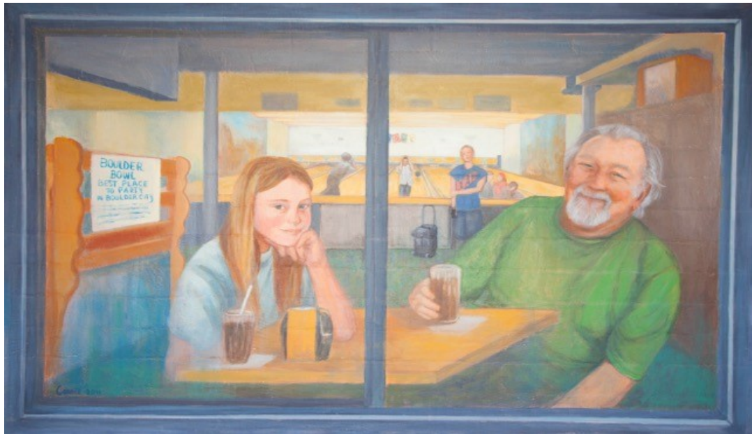
Mural: Trompe L'Oeil Window