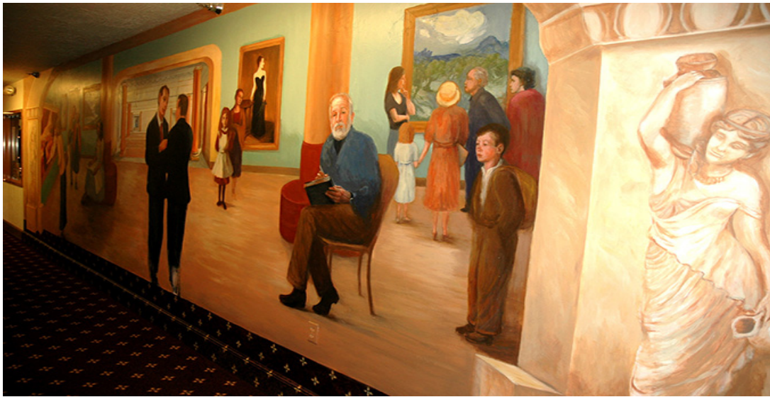
Mural: The Museum – section #1