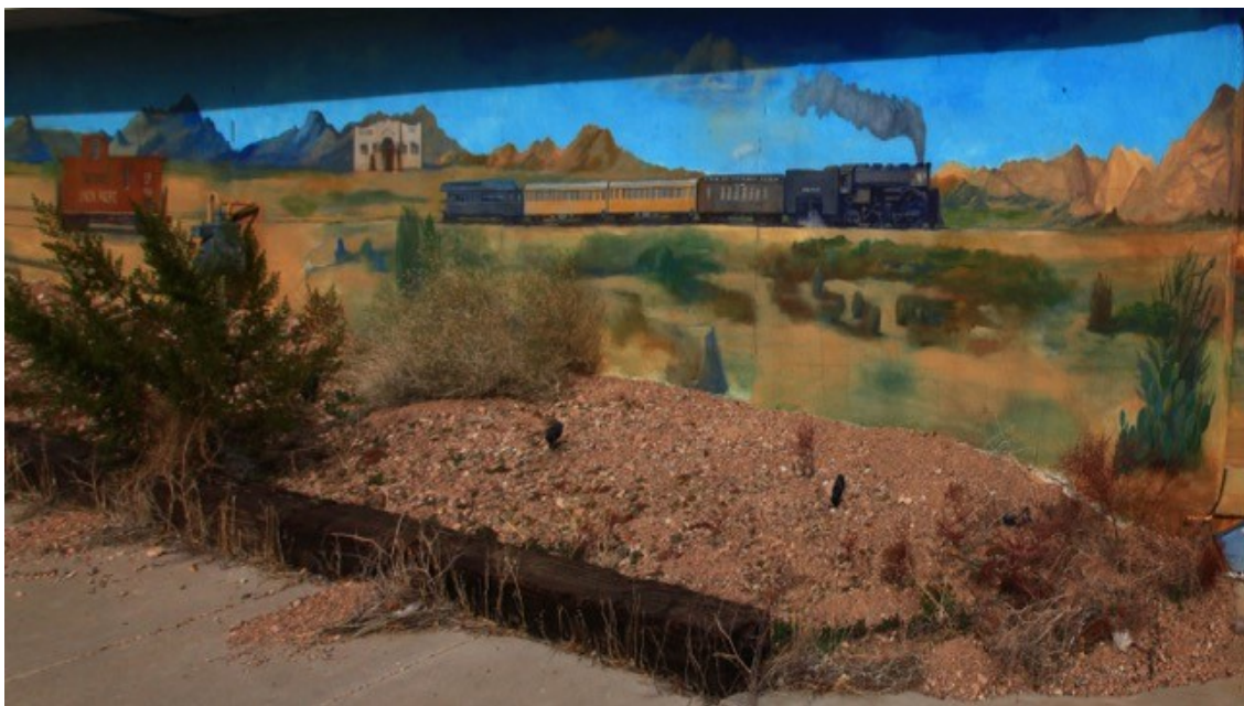
Mural: Train – section 1