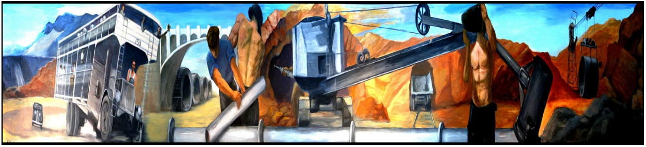
Mural: Boulder Dam Brewing Company