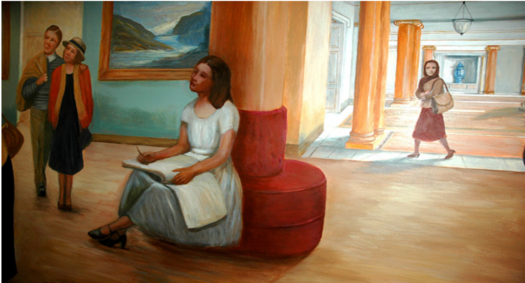
Mural: The Museum – section 2