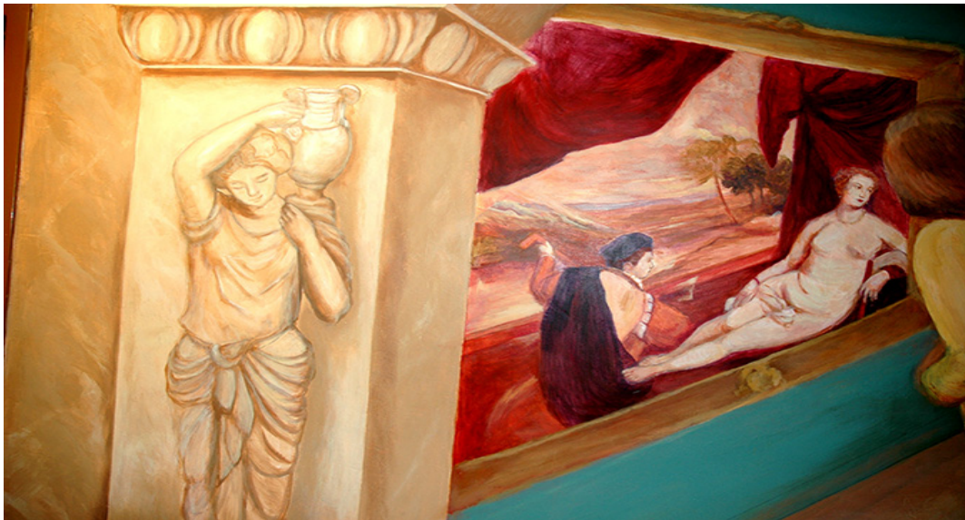
Mural: The Museum – section 3