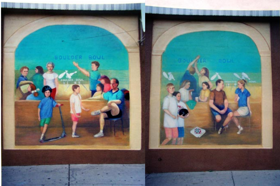
Mural: Boulder Bowl