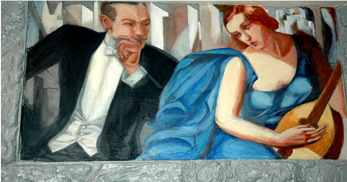
Mural: Art Deco Mural #2