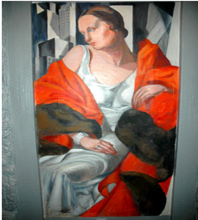
Mural: Art Deco Mural #1

History: By July 1934, Six Companies, Inc., the combined six companies that built the Hoover Dam, employed 5,251 men. By 1931, housing was being constructed for workers and their families in what is now known as Boulder City. This mural reflects the 150 Hoover Dam heavy machine operators and laborers who traveled to and from work each day on buses similar to the one depicted in this mural.