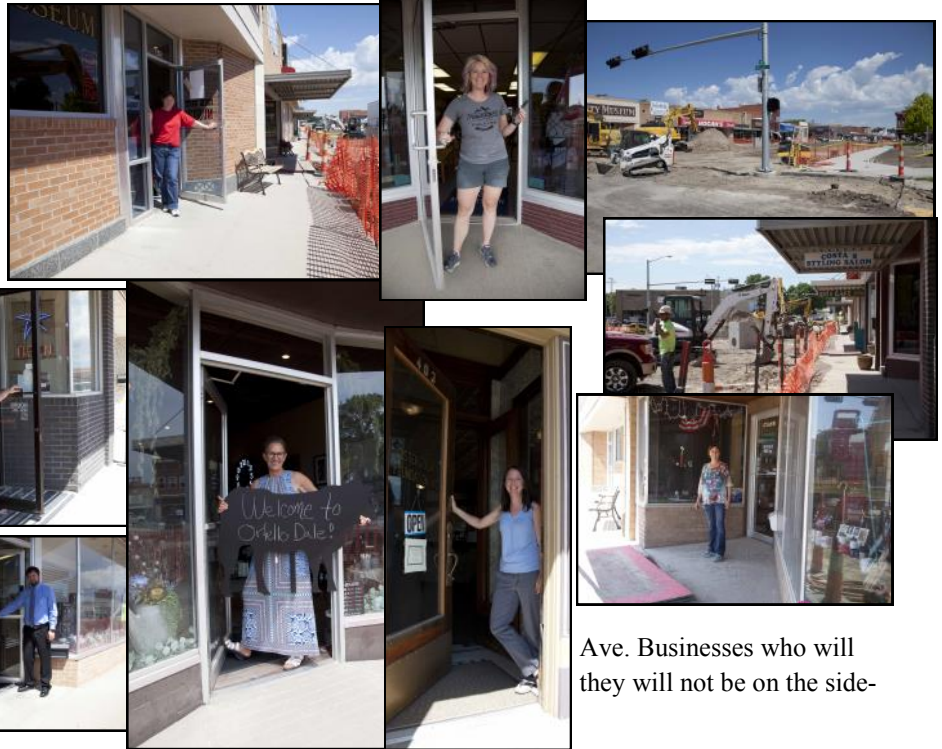
Ave. Businesses who will they will not be on the side-

As we have celebrated 8th Ave. and part of South D being open remember the Square is still under construction. All the businesses are OPEN either by their front or back door. They have their back doors marked for you. Always watch your step and remember if need be, you are welcome to give them a call and they can meet you. Custer County Foundation does not really have a back door, but you can access them through Troxel Insurance. Also keep in mind that Great Western Bank now has it's drive thru open! For the 9th have CRAZY DAYS sales, walk but inside instead.