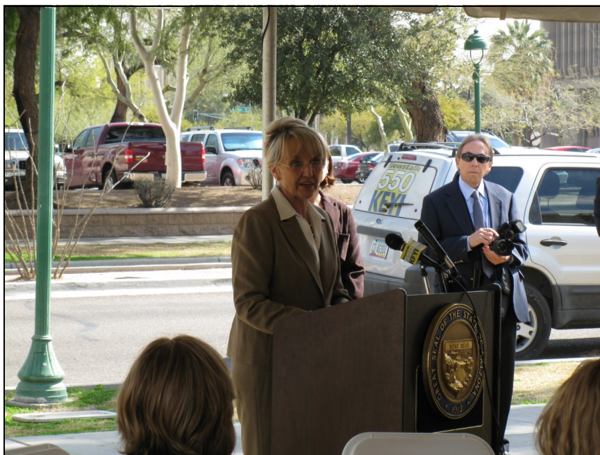
Governor Jan Brewer Chamber Day at The Legislature