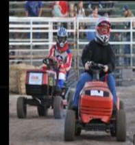
Racing Riding Lawn Mowers "Old Guys NASCAR"