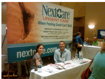
NextCare Urgent Care