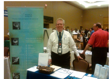
Hospice of the Valley