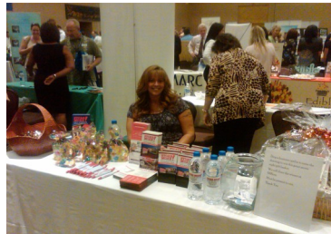
Store More! Self Storage