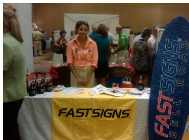
FastSigns on Bell Rd.