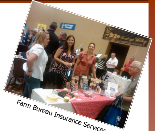
Farm Bureau Insurance Services