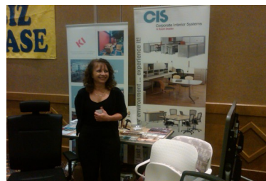
Corporate Interior Systems