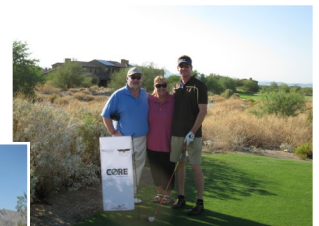
CORE Construction Golf Teams