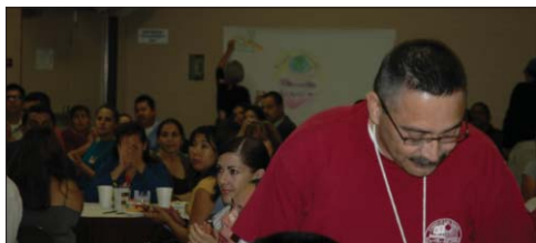
A REPRESENTATIVE from Pamela Park planning with staff and parents.

These volunteers and supporters should feel good about motivating students and making students lives more than learning from books.