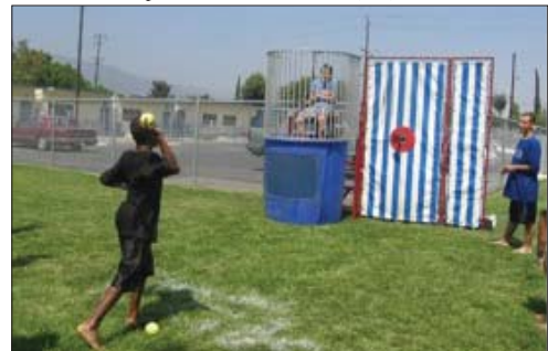
THE WET & WILD CARNIVAL is a great way to start the summer!

Transportation will be provided for all events from each supervised park site with signed permission form. For more information, please call Duarte Recreation at (626) 357-7931.