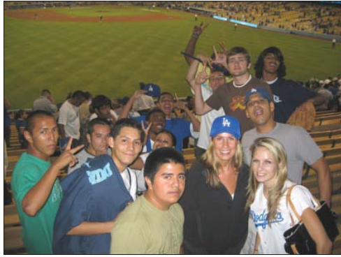
DUARTE TEEN CENTER enjoying the LA Dodger Game!