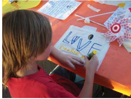
YOUTH making a flag.

If you are interested in The Mini Miracle program for your student at Maxwell Elementary School, you can contact, Airika Narcisse at (626) 357-7931 ext. 267.