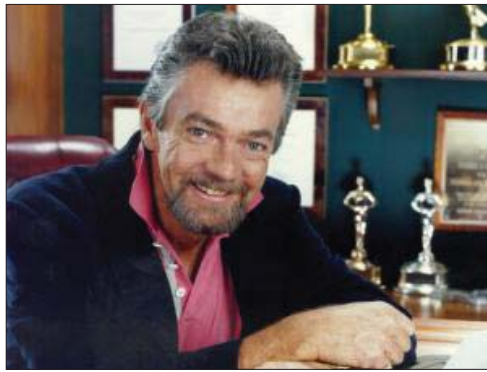
AUTHOR STEPHEN J. CANNELL