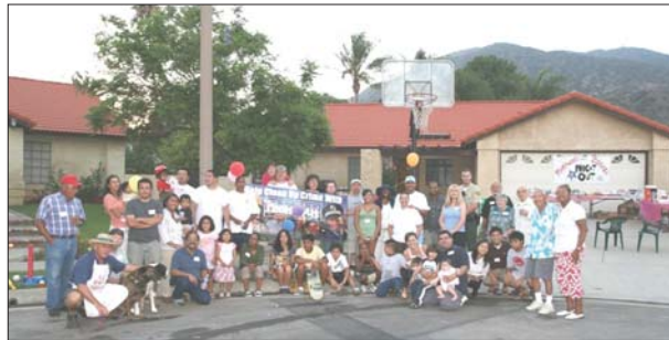
THE MARKWOOD AND CONATA TEAM.