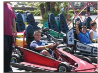
ADVENTURE CAMP participants enjoy many fun activities!

Each day will be highlighted by a trip to places such as the beach, Knott's Berry Farm,