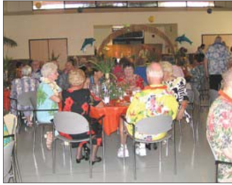
JOIN US AT THE Duarte Senior Center for our annual luau party in August. Please call for more information (626) 357-3513.

The Duarte Senior Center is always in need of volunteers to help with food preparation, serving, table setups, craft projects, decorating, etc. If you would like to give back to the community,