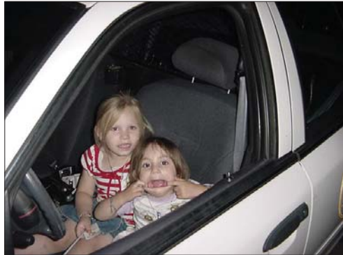
YOUNG GIRLS getting to know the police car.

For more information call the Fitness Center at (626) 357-6118.