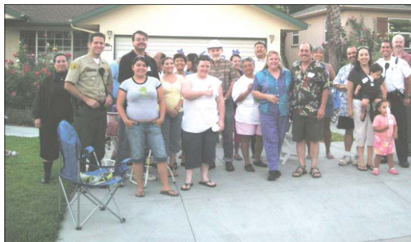
TOCINO TEAM at their BBQ.