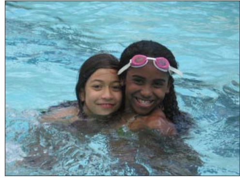
THE DUARTE FITNESS CENTER POOL is the way to stay cool this summer!