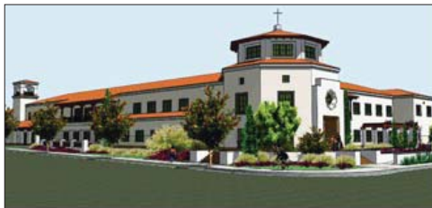
Artist rendition of the proposed expanded Maryvale Family Resource and Early Childhood Education Center to begin construction this fall at the corner of Huntington Dr. and Crestfield Dr., in Duarte.