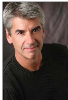
AUTHOR D.J. MACHALE and his wildly popular adventure-fantasy book series, "Pendragon".

In all, more than 40 authors will meet the public, talk and sign their books from 10 a.m. to 4 p.m. on the historic grounds of Westminster Gardens, 1420 Santo Domingo Ave. Admission