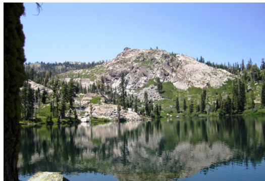
Lakes Basin