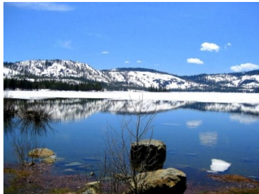
Gold Lake pictures