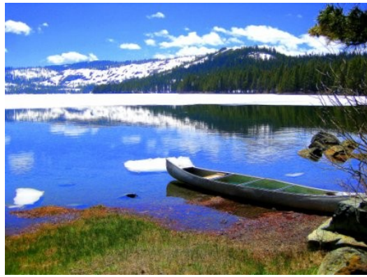
Gold Lake pictures courtesy of Linda Henris

Details of the map can be found at www.mappery.com courtesy of the US Forestry Service.