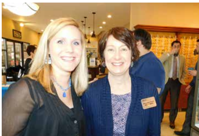
Metro Eye Care, March 16