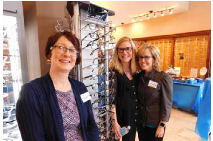
Metro Eye Care, March 16