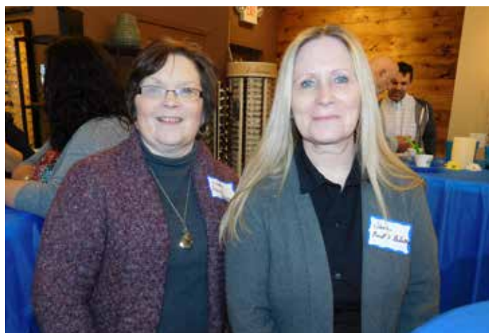
Metro Eye Care, March 16