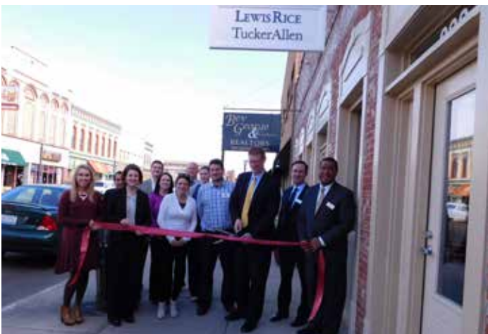
TuckerAllen LLC, March 22