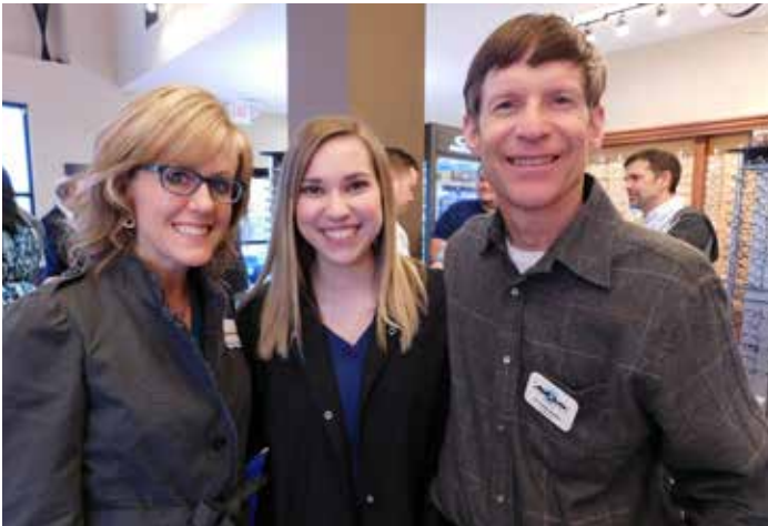
Metro Eye Care, March 16