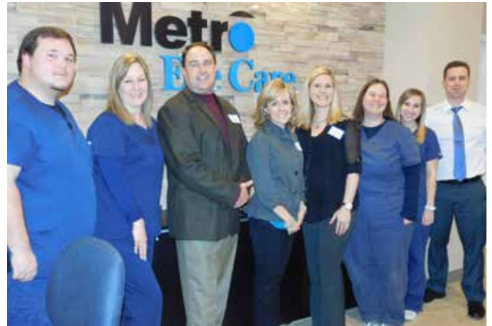
Metro Eye Care, March 16