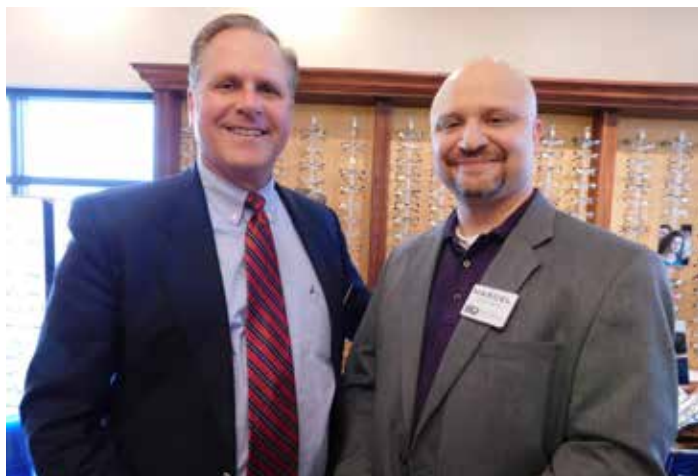
Metro Eye Care, March 16