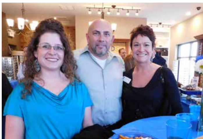
Metro Eye Care, March 16