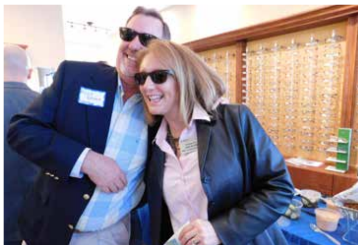
Metro Eye Care, March 16