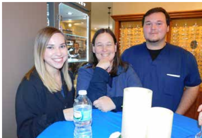
Metro Eye Care, March 16