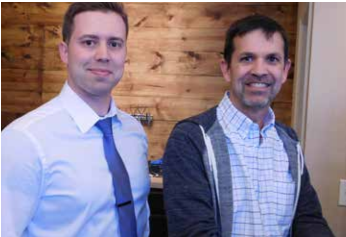
Metro Eye Care, March 16