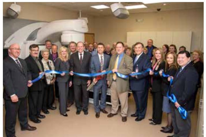
AndersonMercy Cancer Care's Radiation Oncology Elekta Infinity™, March 30