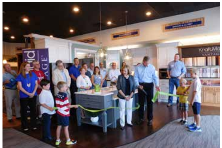
South Maple Design by R.P. Lumber, July 25