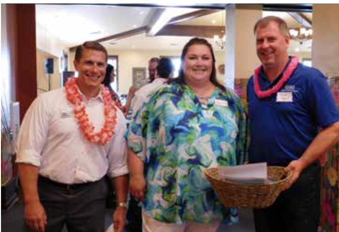
Stillwater Senior Living, July 20