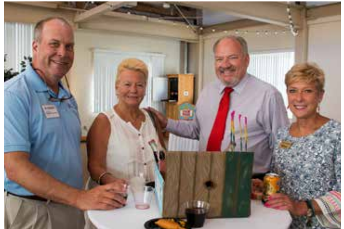
Bella Milano, First Mid-Illinois Bank & Trust, Gori Julian, Korte & Luitjohan, and Robert 'Chick' Fritz, June 15