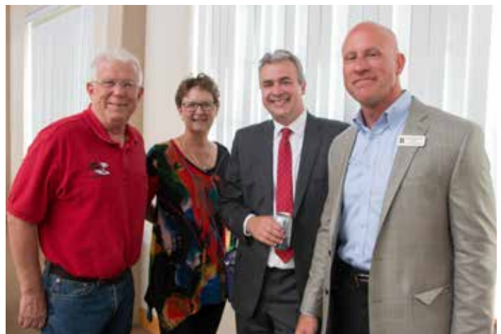
BA5, June 15