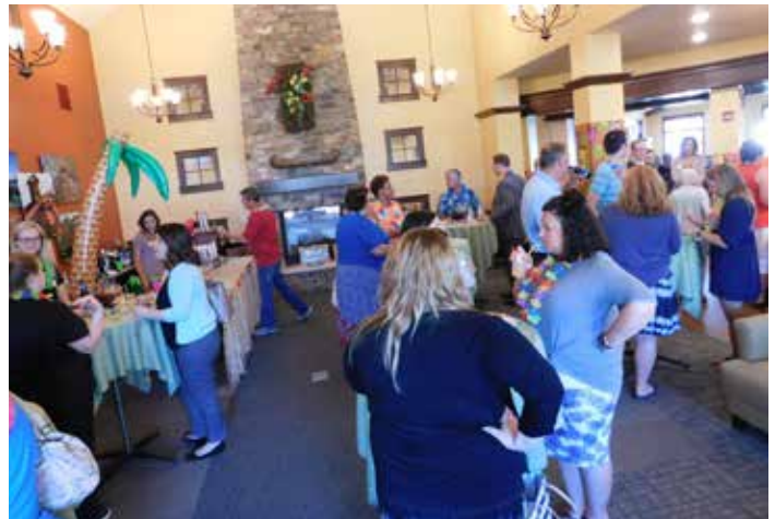
Stillwater Senior Living, July 20