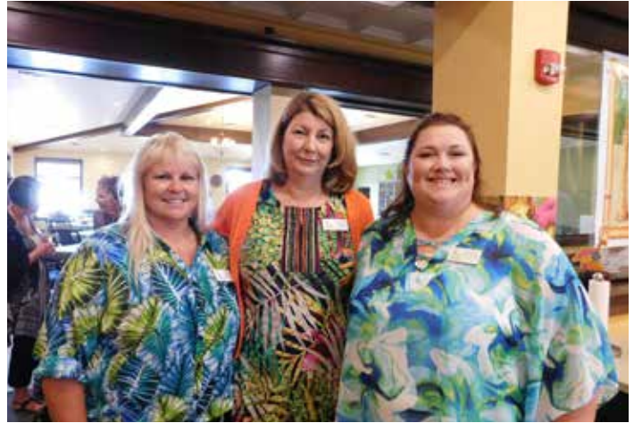
Stillwater Senior Living, July 20