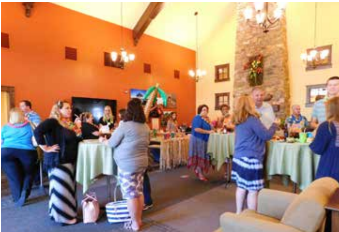
Stillwater Senior Living, July 20