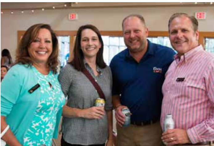
BA5, June 15