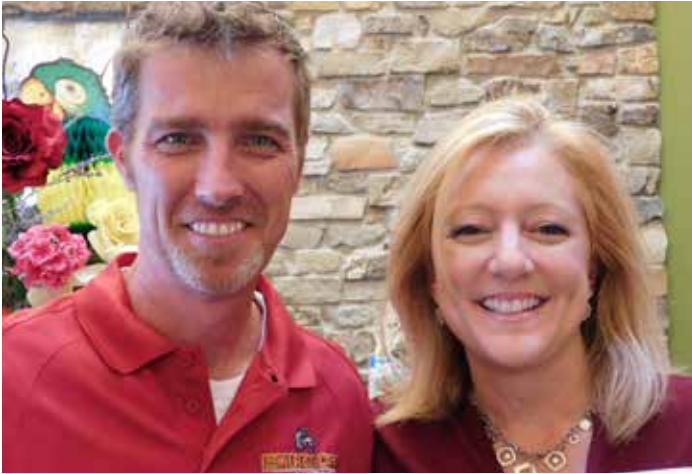
Stillwater Senior Living, July 20