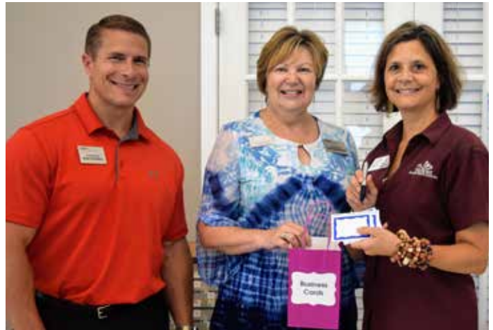
July 18: Meridian Village