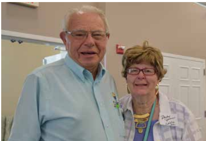
July 18: Meridian Village