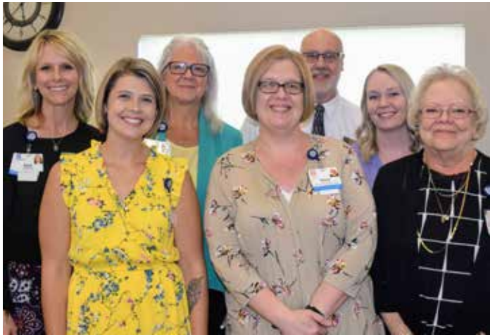
July 18: Meridian Village