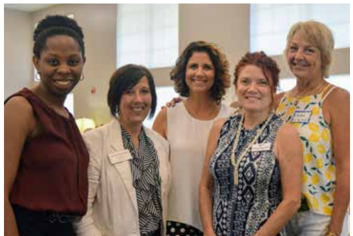
July 18: Meridian Village