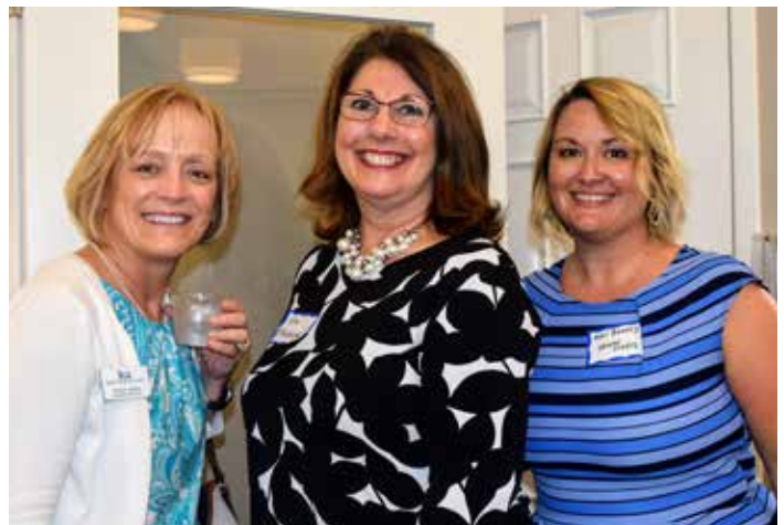
July 18: Meridian Village