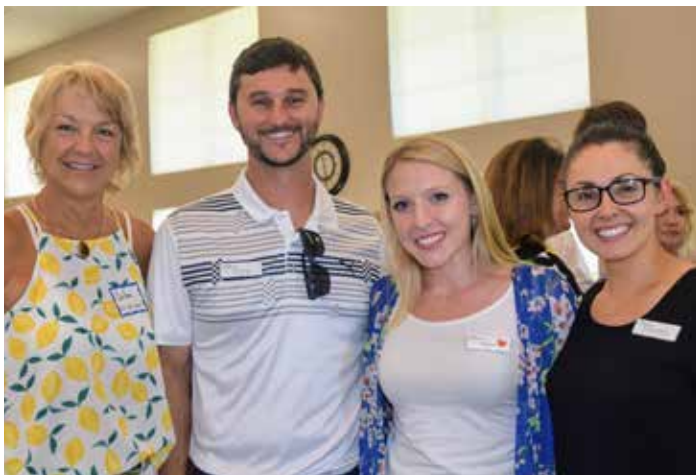
July 18: Meridian Village