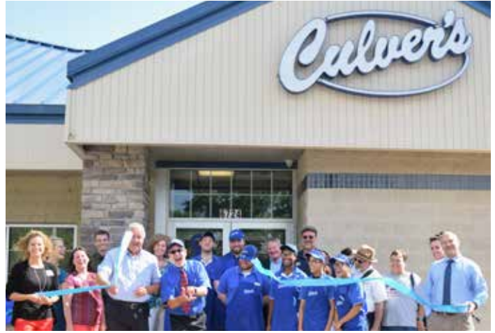
July 22: Culver's of Edwardsville Grand Re-Opening