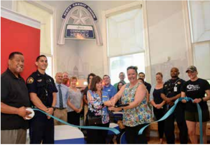
July 19: Scott Credit Union Community Heroes Exhibit @ Edwardsville Children's Museum