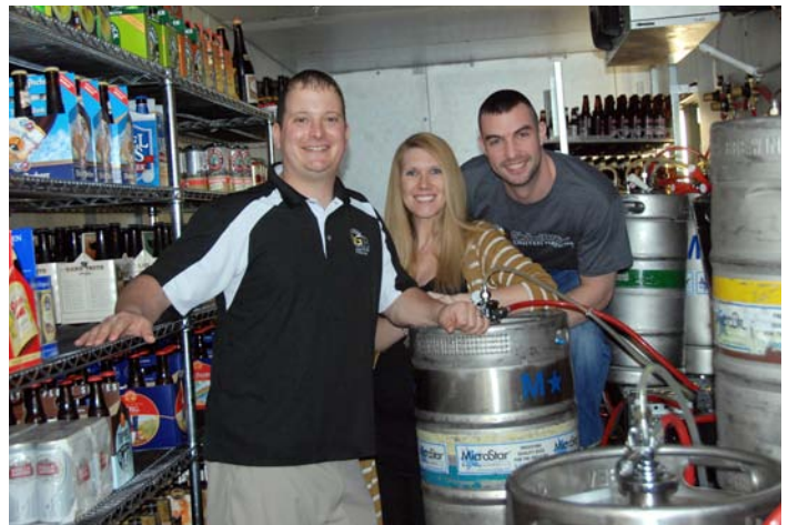
Global Brew Tap House & Lounge, March 22