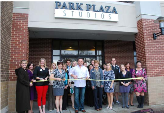
DMWII Salon @ Park Plaza, March 22