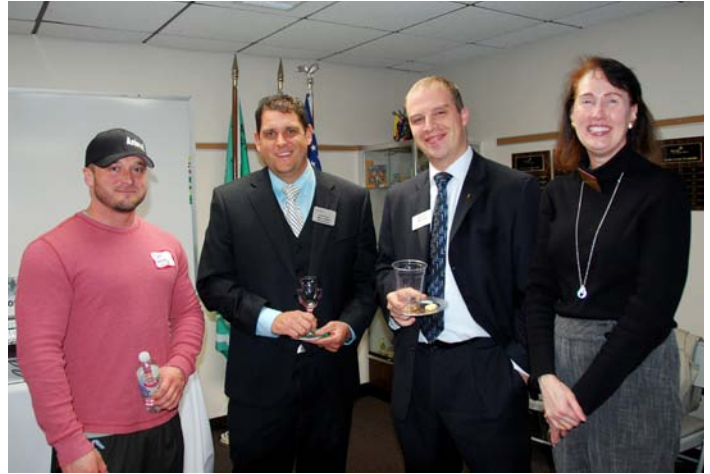
Girl Scouts of Southern Illinois, March 8