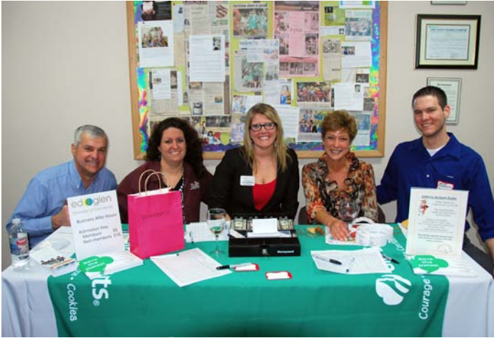
Girl Scouts of Southern Illinois, March 8