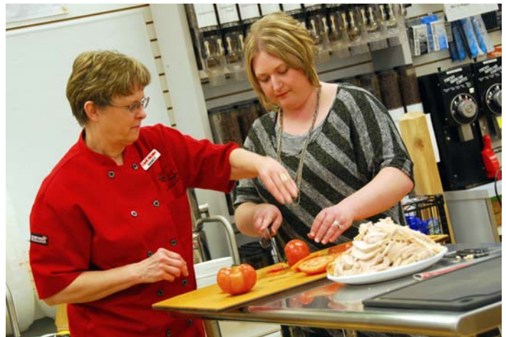
Young Professionals Group Knife Skills Class at Chef's Shoppe, March 15