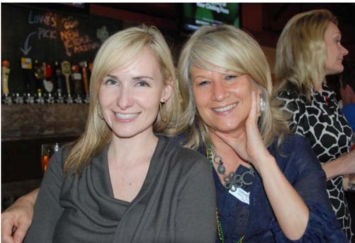
Global Brew Tap House & Lounge, March 22