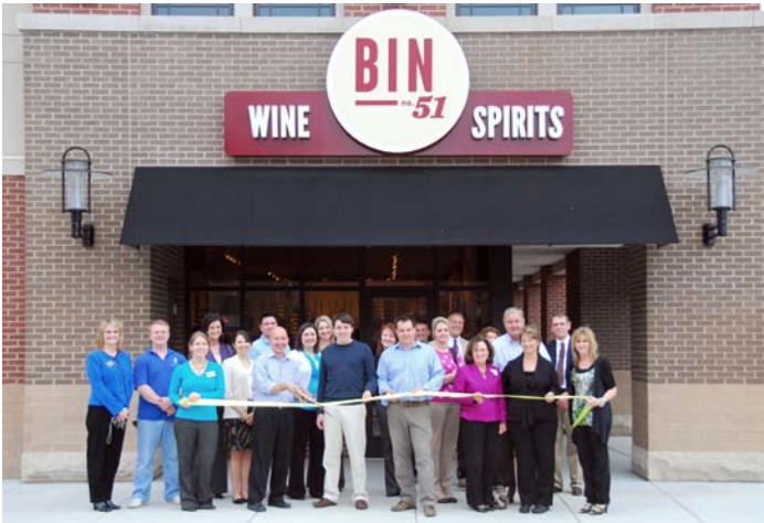
Bin 51 Wine & Spirits, March 7