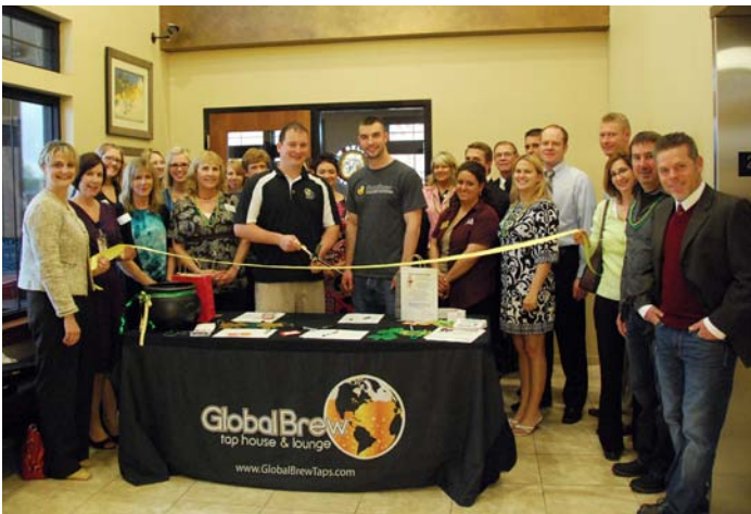
Global Brew Tap House & Lounge, March 22