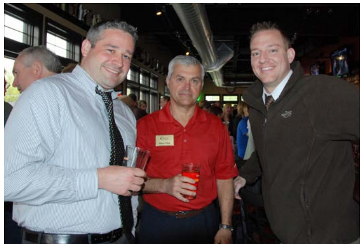
Global Brew Tap House & Lounge, March 22