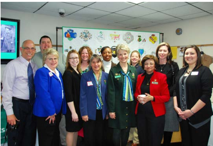
Girl Scouts of Southern Illinois, March 8