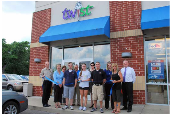
Twist Fro Yo Cafe, July 13