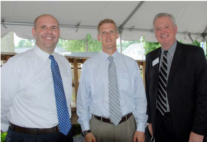
Sivia Business & Legal Services, July 7