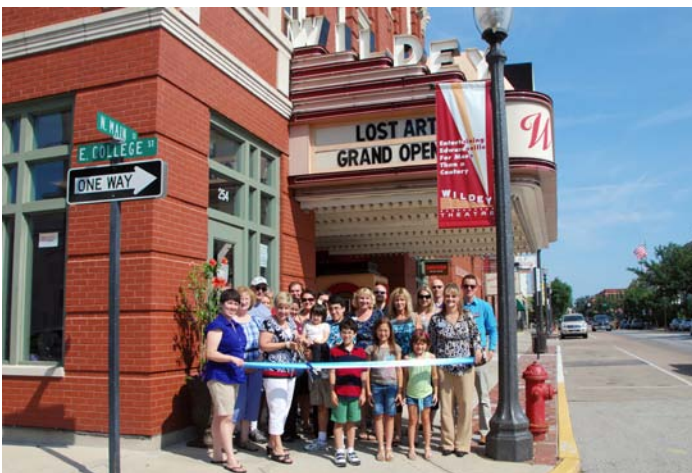
Lost Arts & Antiques, July 20