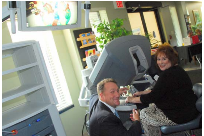
Gateway Regional Medical Center's Edwardsville Health Center, July 21