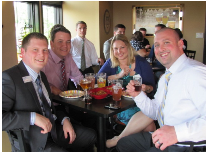
ABOVE: A YPG Beer Tasting event was held at Global Brew Tap House & Lounge in June.