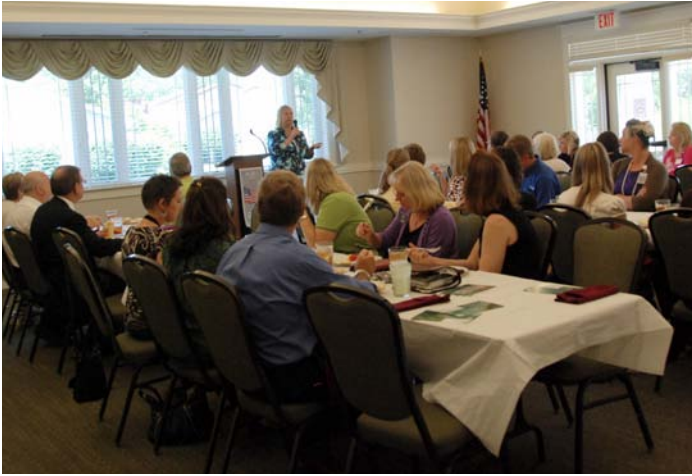
Hosted by Eden Village Retirement Community, July 8