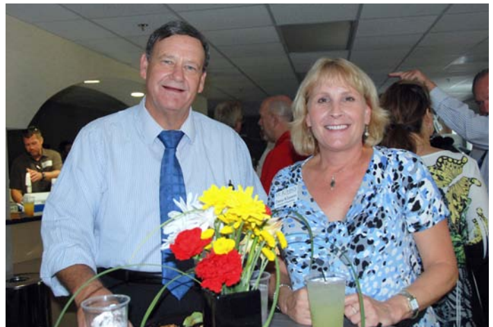
Gateway Regional Medical Center's Edwardsville Health Center, July 21