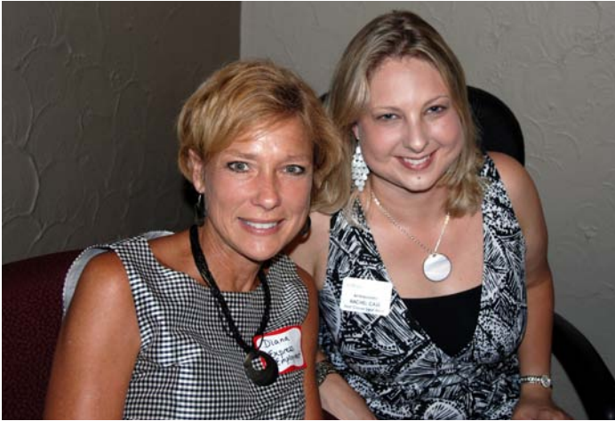
Sivia Business & Legal Services, July 7