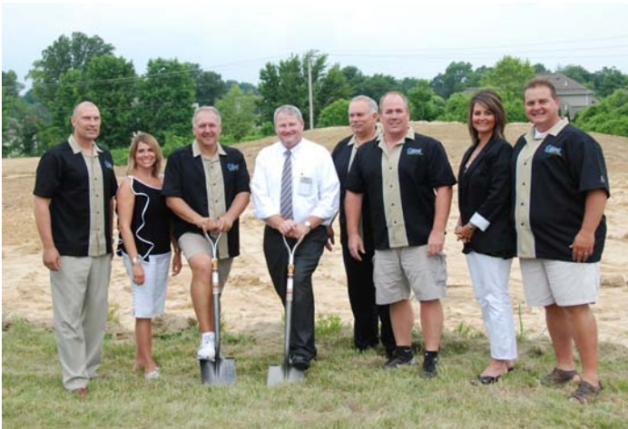
Edison's Entertainment Complex, July 7