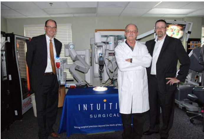
Gateway Regional Medical Center's Edwardsville Health Center, July 21