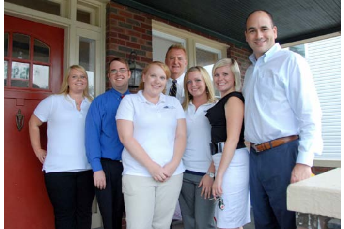
Sivia Business & Legal Services, July 7