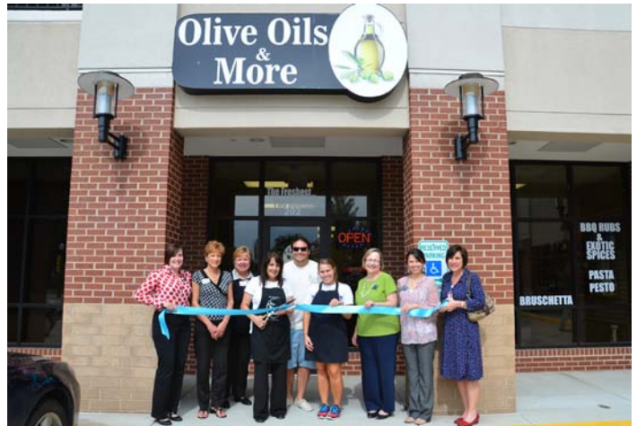
Olive Oils & More, May 21