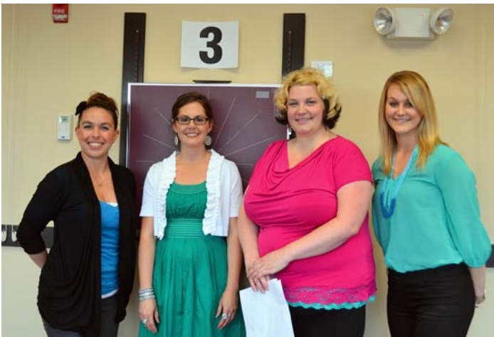
Vision For Life, May 23