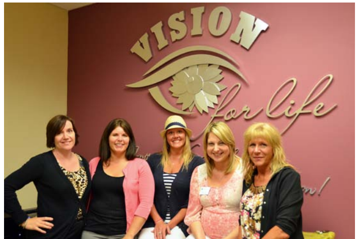
Vision For Life, May 23