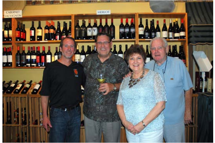
Crushed Grapes, American Family Insurance & Catered AFFAIR, May 2