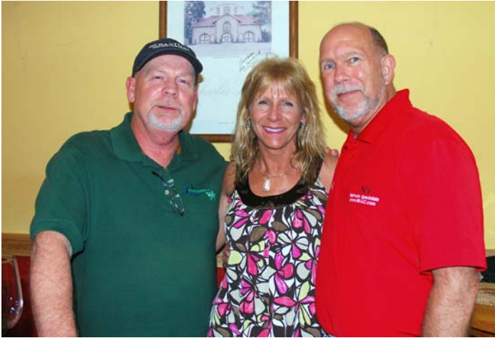
Crushed Grapes, American Family Insurance & Catered AFFAIR, May 2