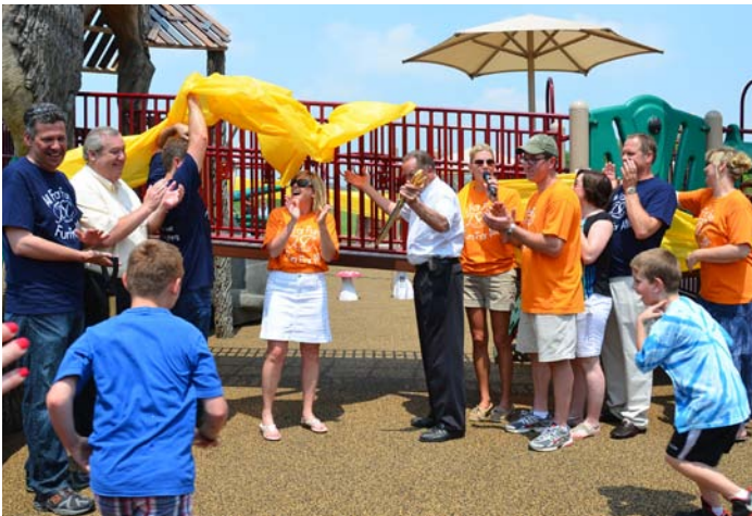
Junior Service Club Boundless Playground, May 19