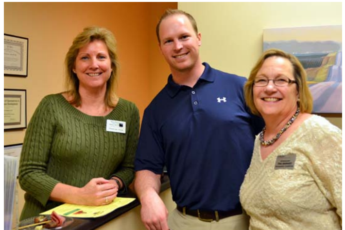
Vision For Life, May 23