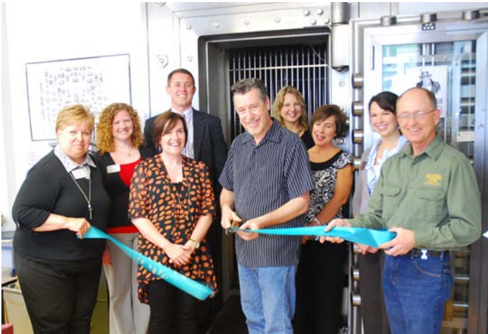
Marine Coin Company, May 3