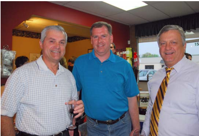
Crushed Grapes, American Family Insurance & Catered AFFAIR, May 2