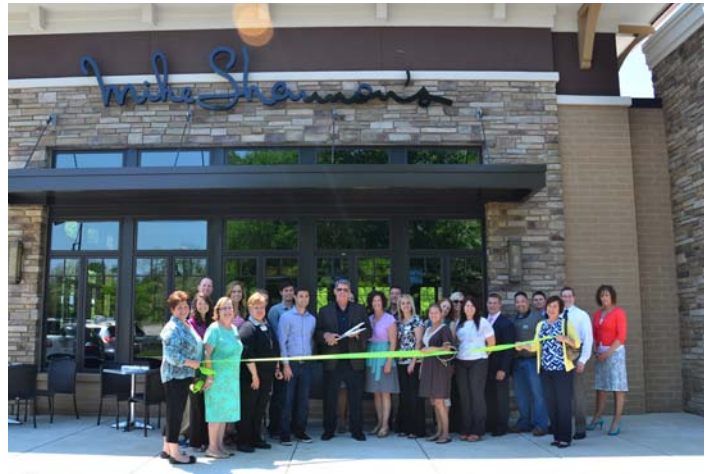
Mike Shannon's Grill, May 15