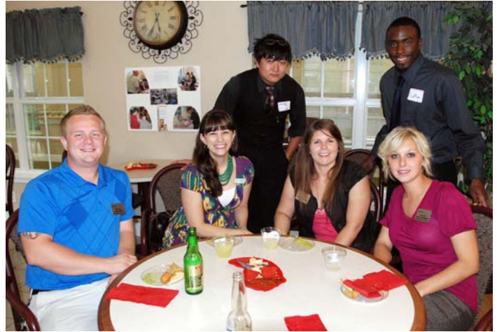
September 6, St. John's Community Care