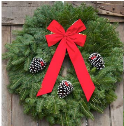
Classic Wreath $20

You will be notified of available pickup dates.