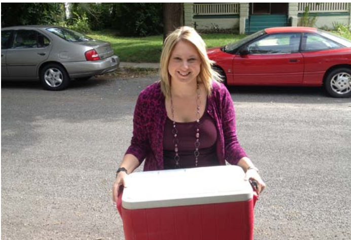
YPG Meals On Wheels Deliveries, September