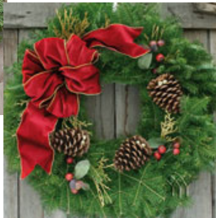
Cranberry Wreath $25