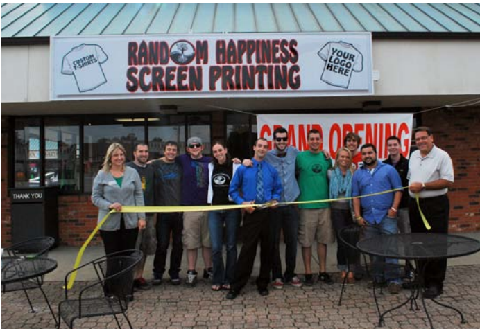
Random Happiness Screen Printing, September 28