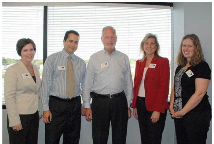
September 20, Benefit Plans Plus & Brown Smith Wallace