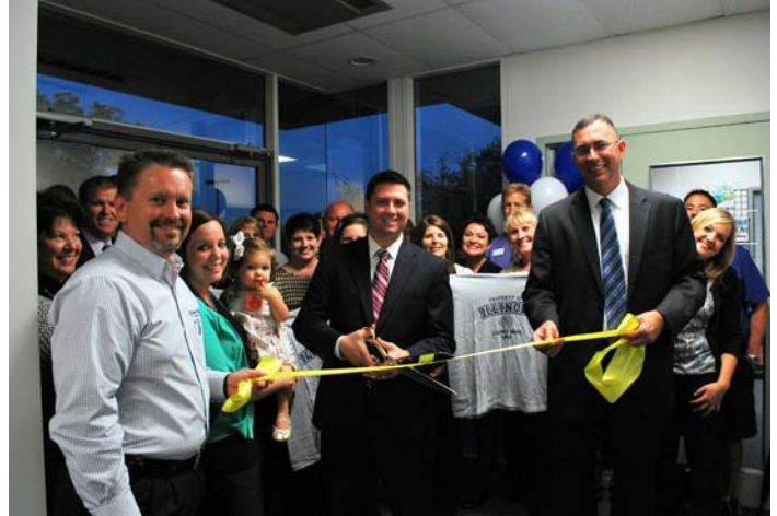
Dimond Bros. Insurance Agency, Inc., September 25