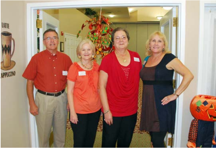
September 6, St. John's Community Care