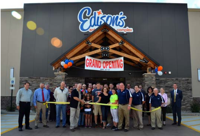
Edison's Entertainment Complex, September 21