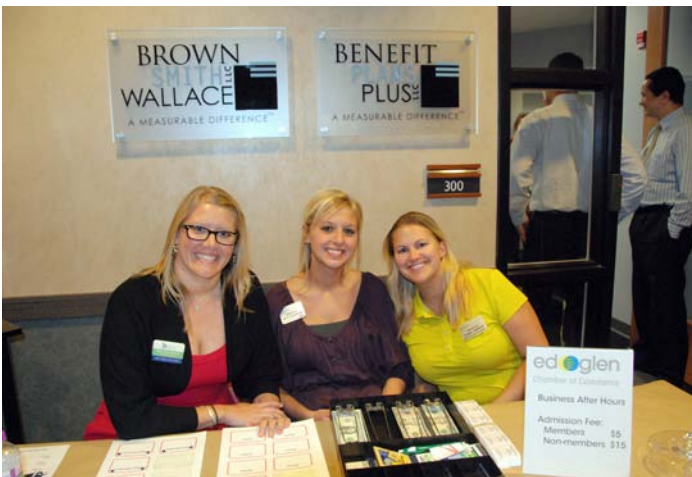
September 20, Benefit Plans Plus & Brown Smith Wallace