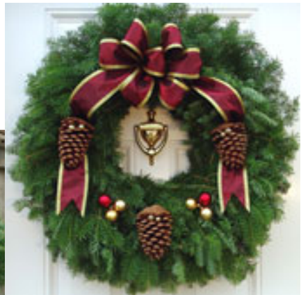
Victorian Wreath $25