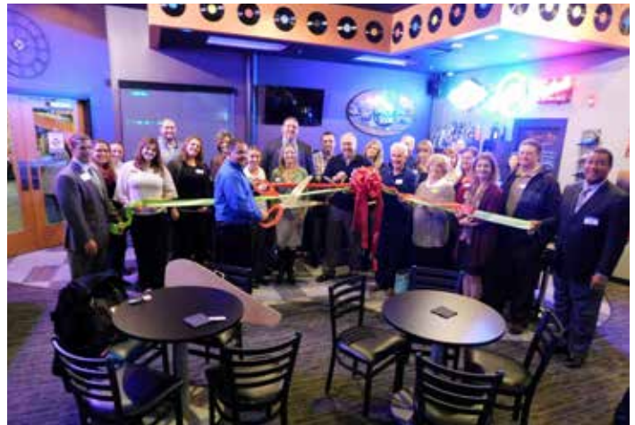
Edison's Entertainment Complex Party Room, November 16