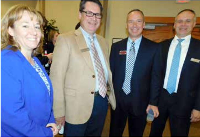
C.J. Schlosser & Company, LLC & TheBANK of Edwardsville, November 19