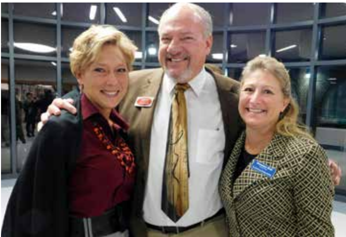
C.J. Schlosser & Company, LLC & TheBANK of Edwardsville, November 19