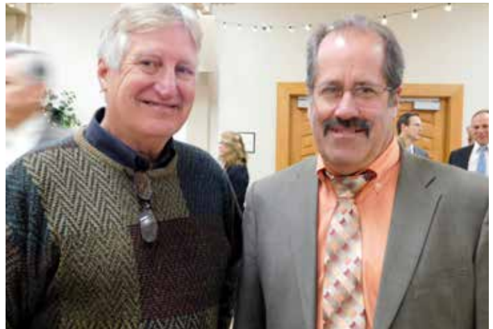
C.J. Schlosser & Company, LLC & TheBANK of Edwardsville, November 19