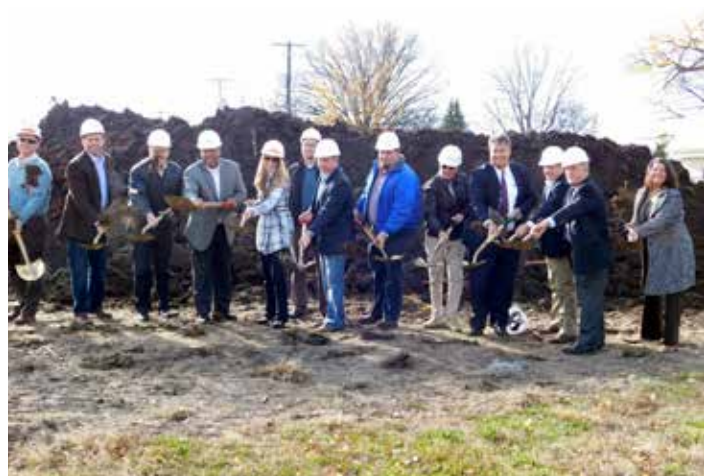
Plocher Construction Park Street Plaza Project, November 20