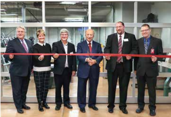
St. Louis Confluence Fab Lab (Lewis and Clark Community College), November 5