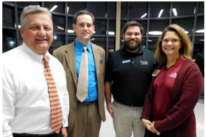
C.J. Schlosser & Company, LLC & TheBANK of Edwardsville, November 19