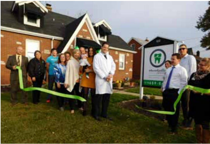
Edwardsville Family Dentist, November 2