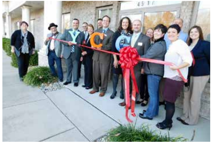
YCG Accounting, November 5