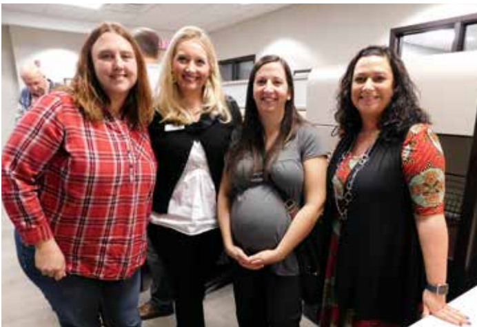
Merrill Lynch, November 17