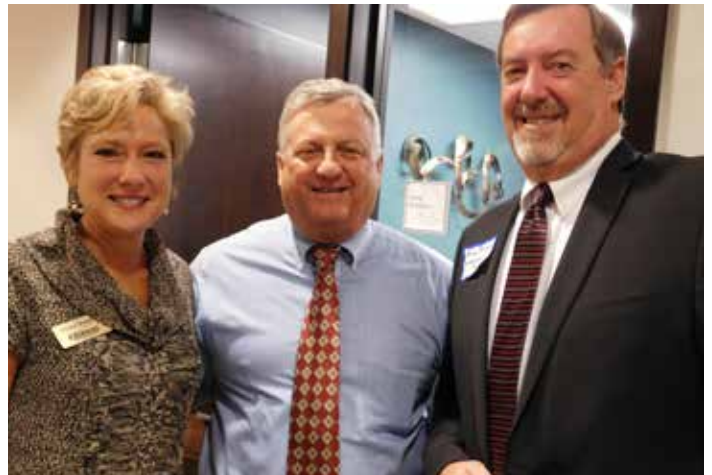
Merrill Lynch, November 17