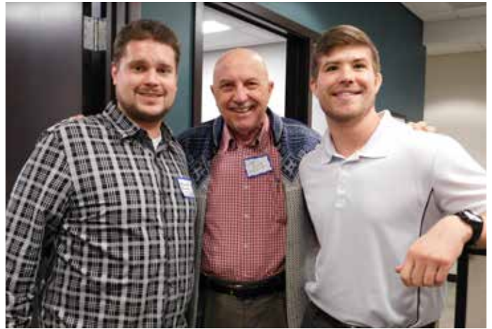
Merrill Lynch, November 17