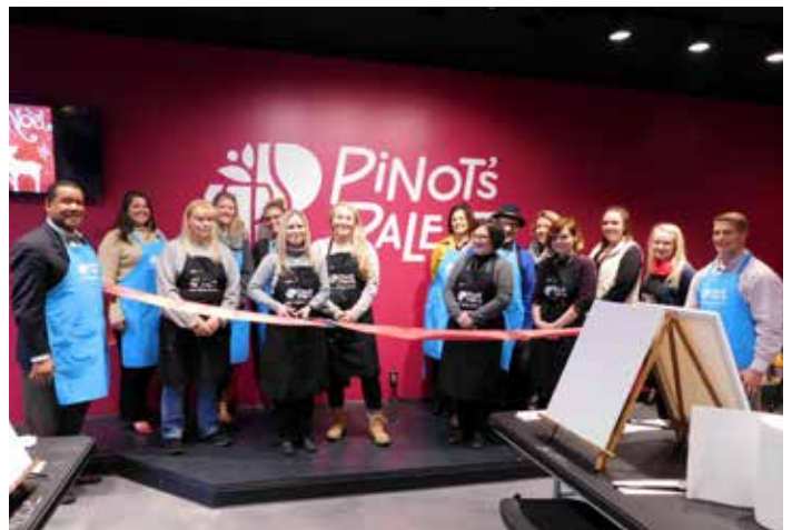
Pino's Palette, November 22