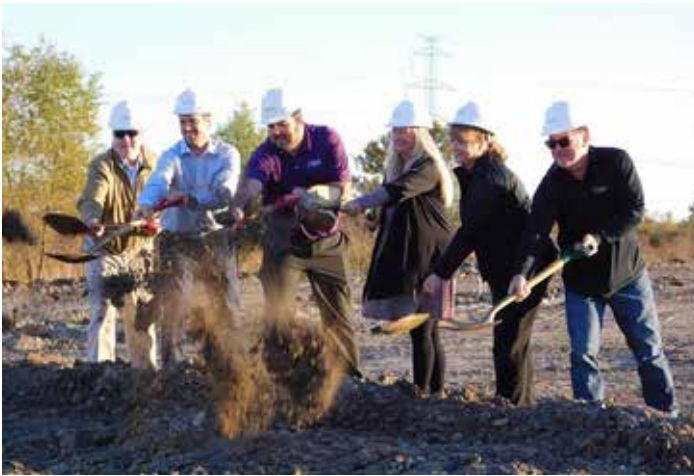
Donco Electrical Construction & Fowler Management Services, November 9