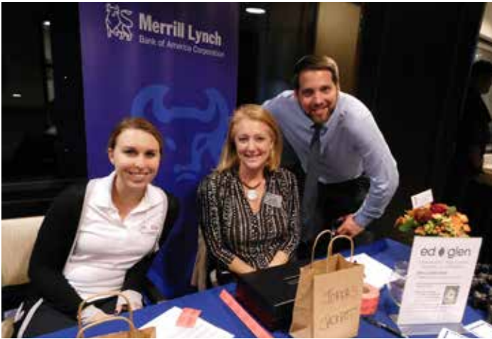
Merrill Lynch, November 17