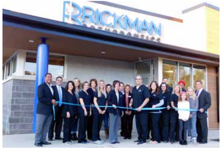
Brickman Orthodontics, November 10