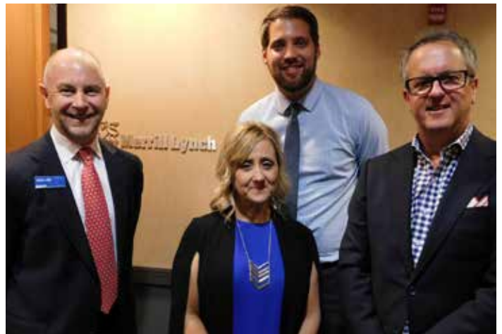
Merrill Lynch, November 17