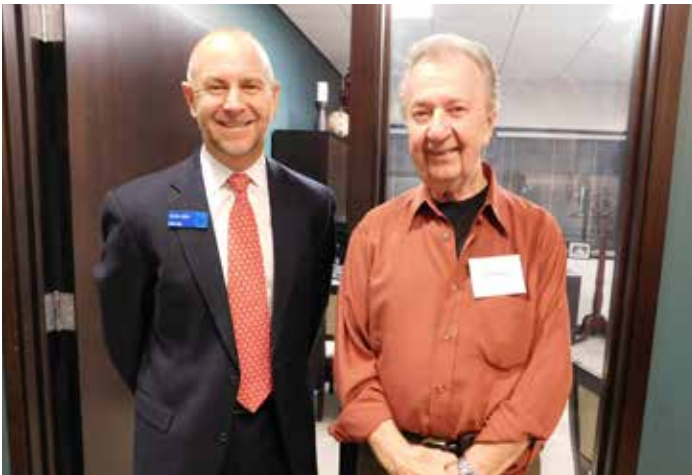
Merrill Lynch, November 17