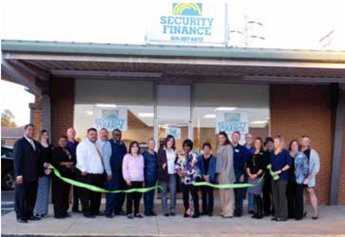
Security Finance, November 16