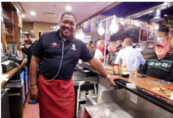
Gulf Shores Restaurant & Grill, December 15