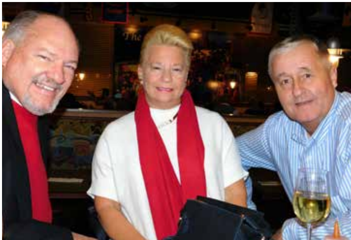
Gulf Shores Restaurant & Grill, December 15