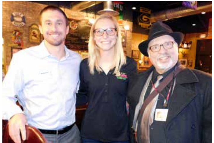
Gulf Shores Restaurant & Grill, December 15