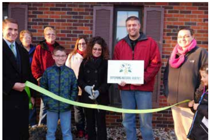
Dayspring Natural Health LLC, December 8