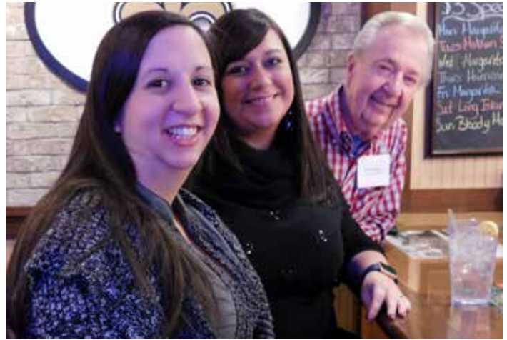
Gulf Shores Restaurant & Grill, December 15