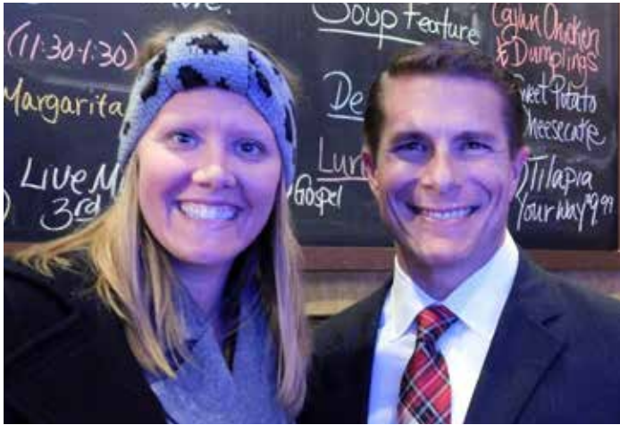
Gulf Shores Restaurant & Grill, December 15