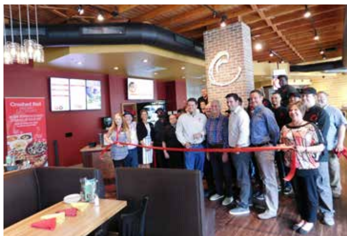
Crushed Red, June 15