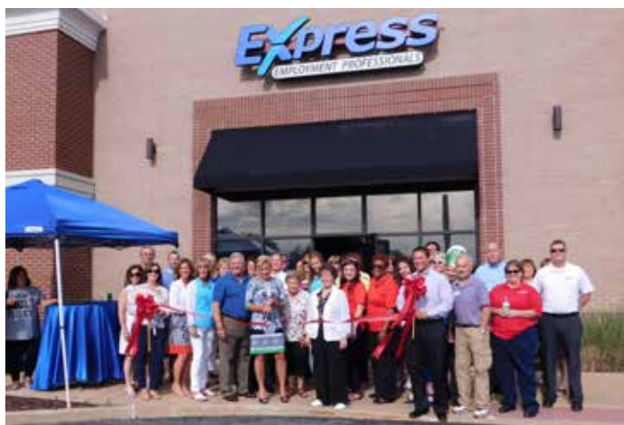
Express Employment Professionals, June 1