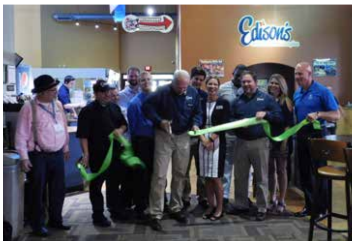
Edison's Entertainment Complex 5th Anniversary, June 15