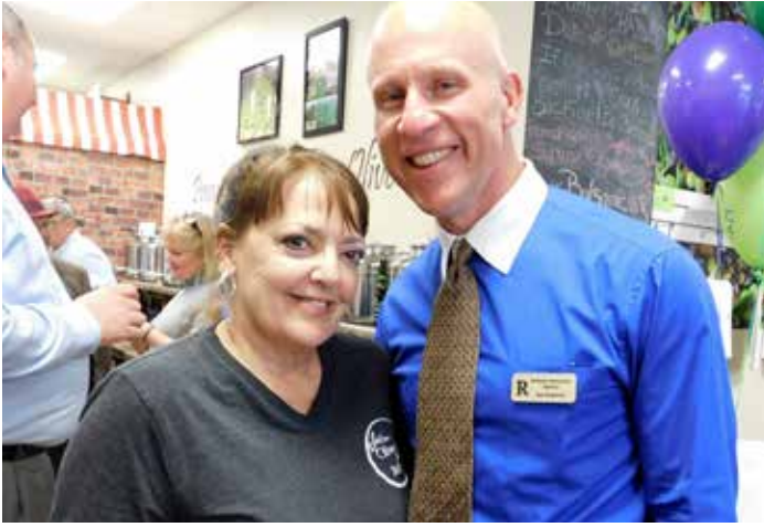
Olive Oils & More, May 19