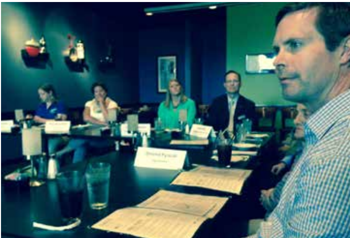
Business Roundtable w/ Congressman Rodney Davis, June 2