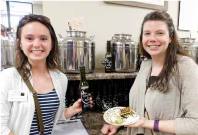
Olive Oils & More, May 19