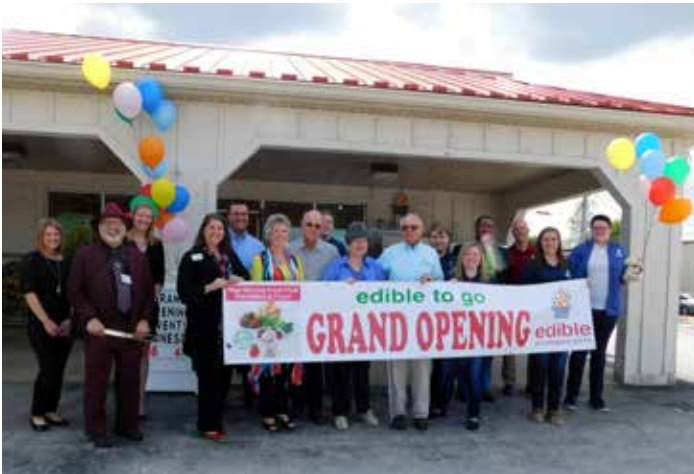
Ribbon Cutting @ Edible Arrangements, May 18