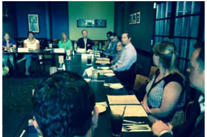
Business Roundtable w/ Congressman Rodney Davis, June 2