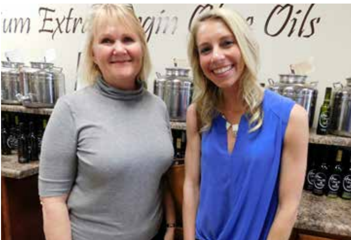
Olive Oils & More, May 19