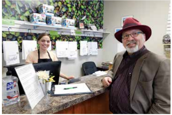
Olive Oils & More, May 19