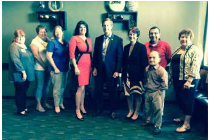
Business Roundtable w/ Congressman Rodney Davis, June 2