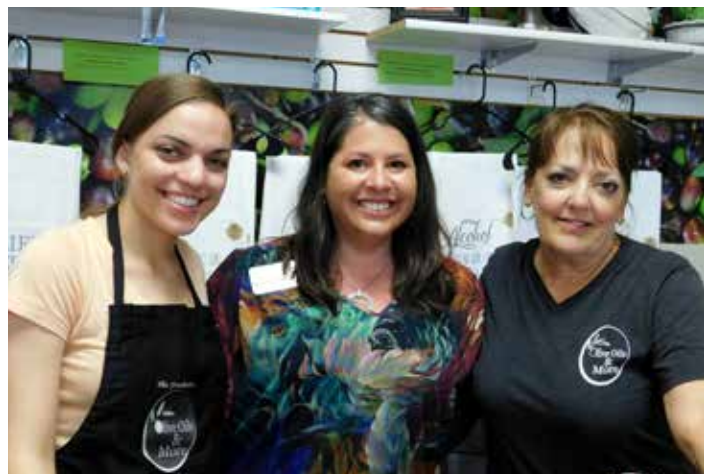
Olive Oils & More, May 19