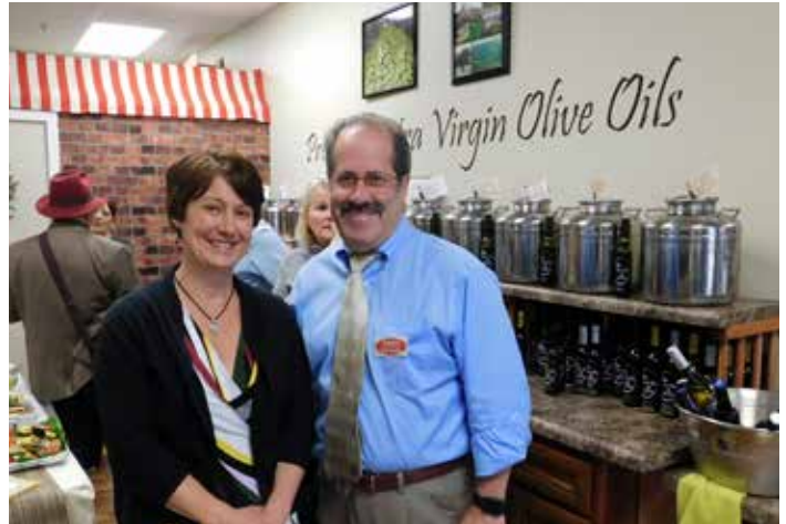
Olive Oils & More, May 19