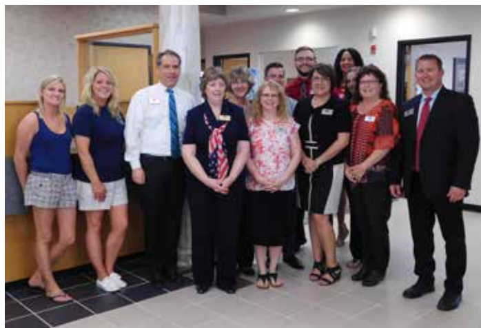
FCB Edwardsville Bank, May 18