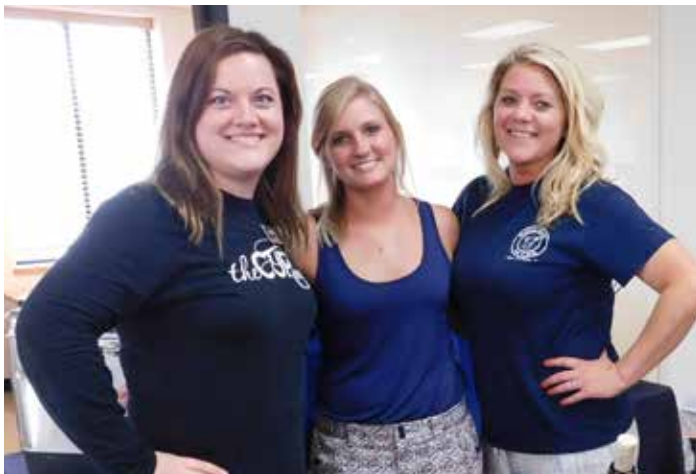
FCB Edwardsville Bank, May 18