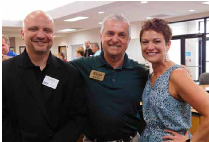
FCB Edwardsville Bank, May 18