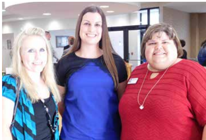
FCB Edwardsville Bank, May 18