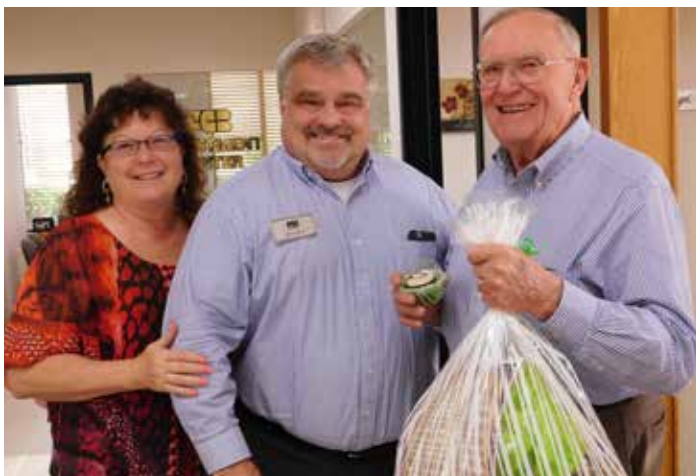
FCB Edwardsville Bank, May 18