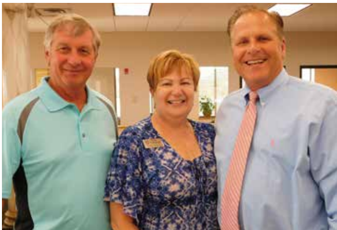
FCB Edwardsville Bank, May 18