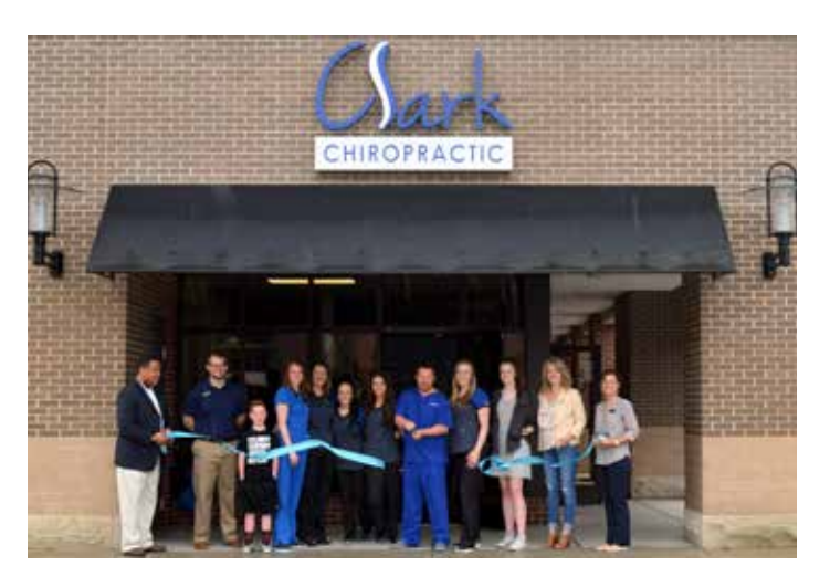
May 18: Clark Chiropractic