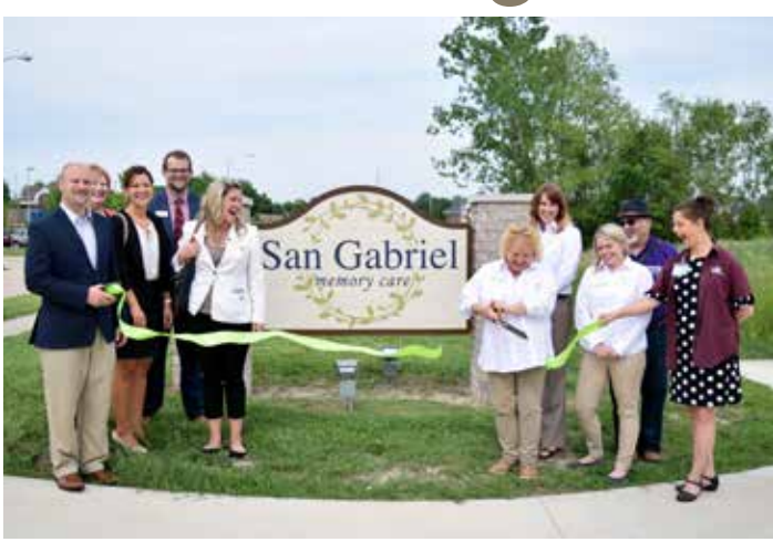
May 17: San Gabriel Memory Care