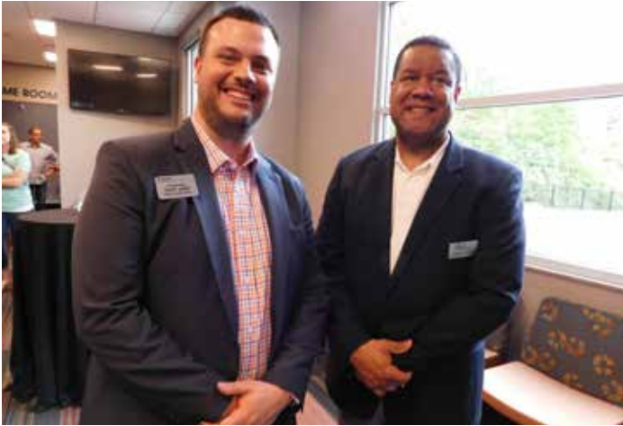
Brickman Orthodontics, April 20