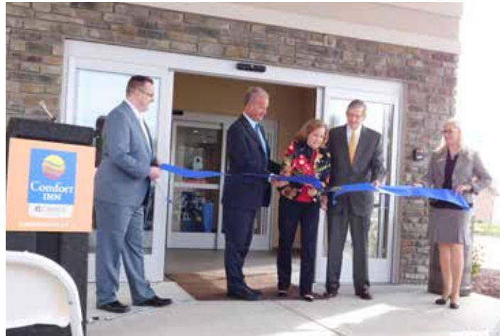
Comfort Inn, April 11