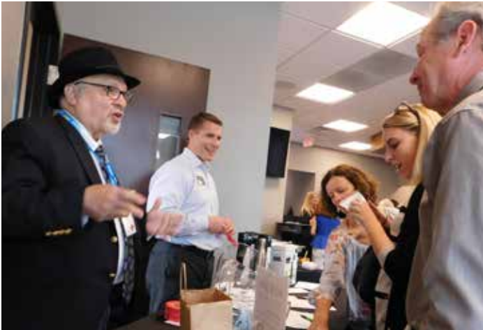
Brickman Orthodontics, April 20