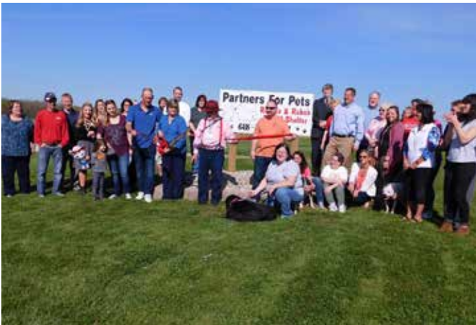
Partners For Pets, April 12