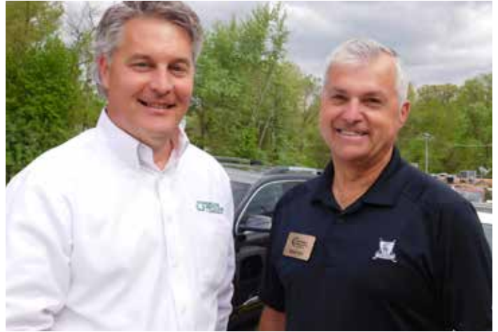
Brickman Orthodontics, April 20