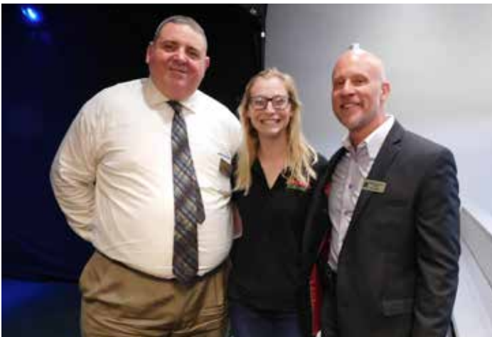
Brickman Orthodontics, April 20