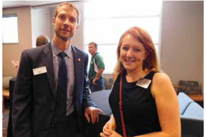
Brickman Orthodontics, April 20