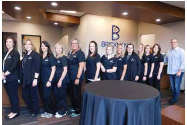
Brickman Orthodontics, April 20