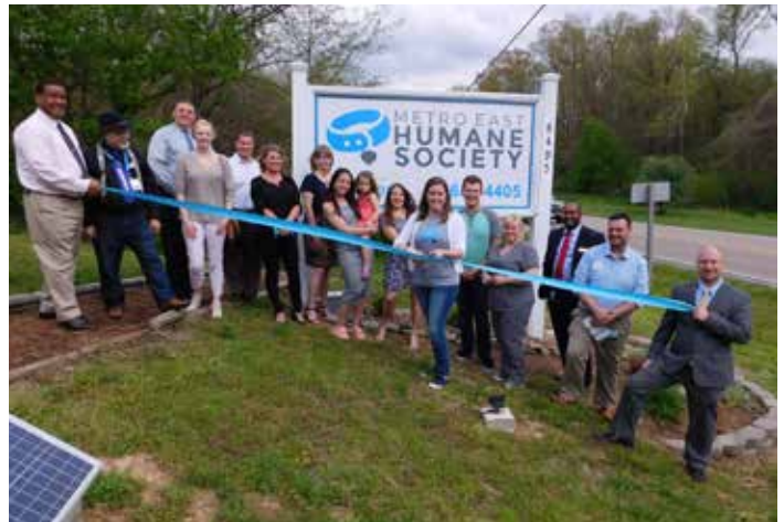
Metro East Humane Society, April 18