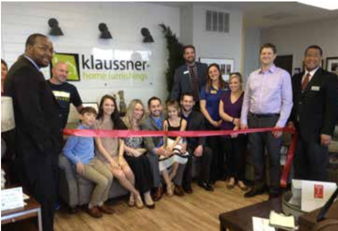
Klaussner Home Store, April 10