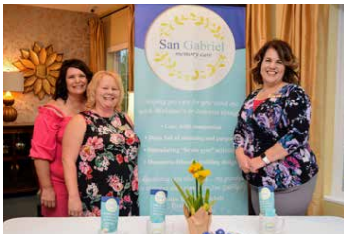
April 18: BA5 @ San Gabriel Memory Care