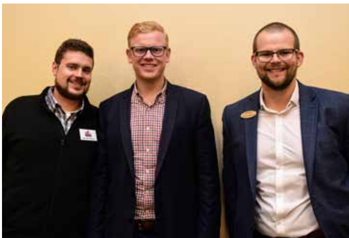
April 18: BA5 @ San Gabriel Memory Care