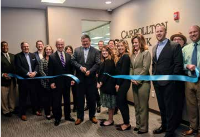
April 1: Carrollton Bank