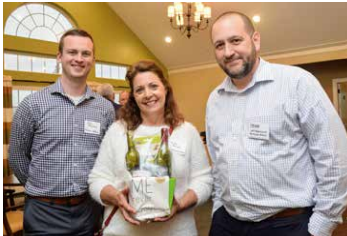
April 18: BA5 @ San Gabriel Memory Care