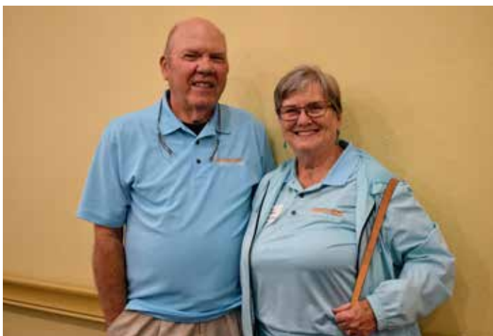
April 18: BA5 @ San Gabriel Memory Care