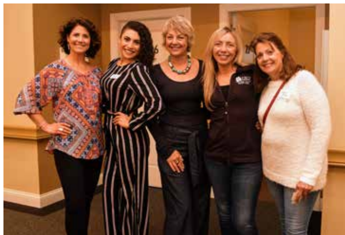
April 18: BA5 @ San Gabriel Memory Care