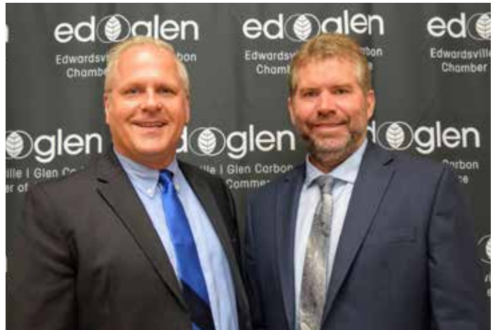
April 25: Mayors' Legislative Breakfast