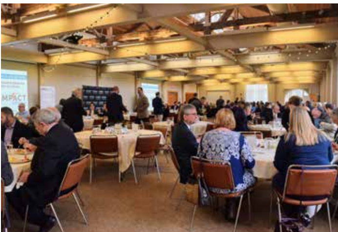
April 25: Mayors' Legislative Breakfast