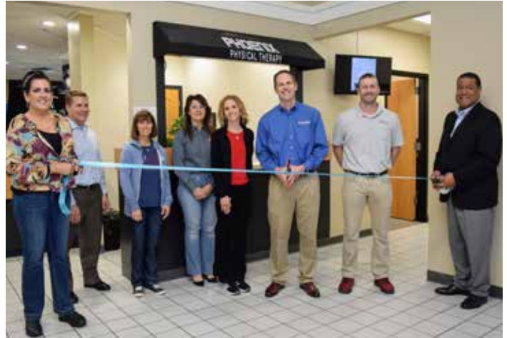
April 11: Phoenix Physical Therapy