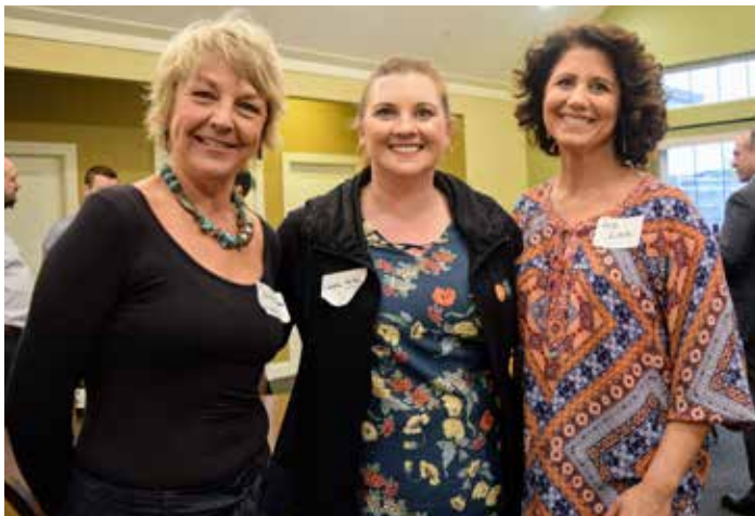
April 18: BA5 @ San Gabriel Memory Care