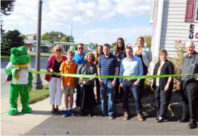
Educational Services Unlimited -20th Anniversary, October 1