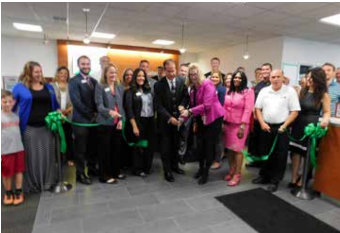
Associated Bank, October 8