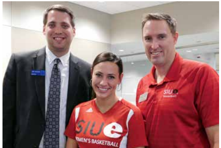
SIUE School of Business & SIUE Athletics, October 15