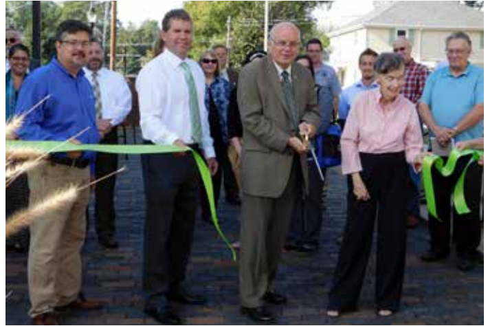
Madison County Historical Society Courtyard, October 6