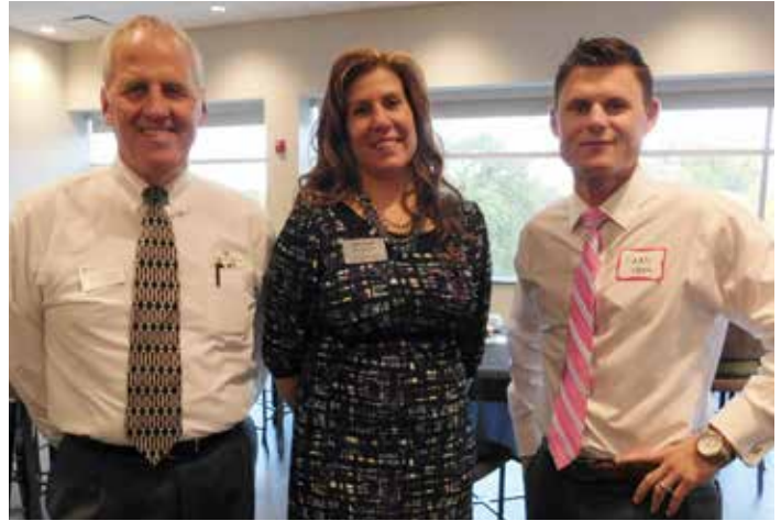
SIUE School of Business & SIUE Athletics, October 15