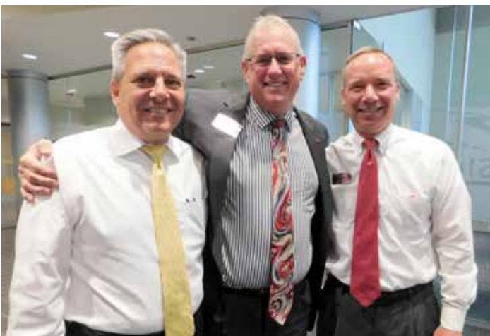
SIUE School of Business & SIUE Athletics, October 15