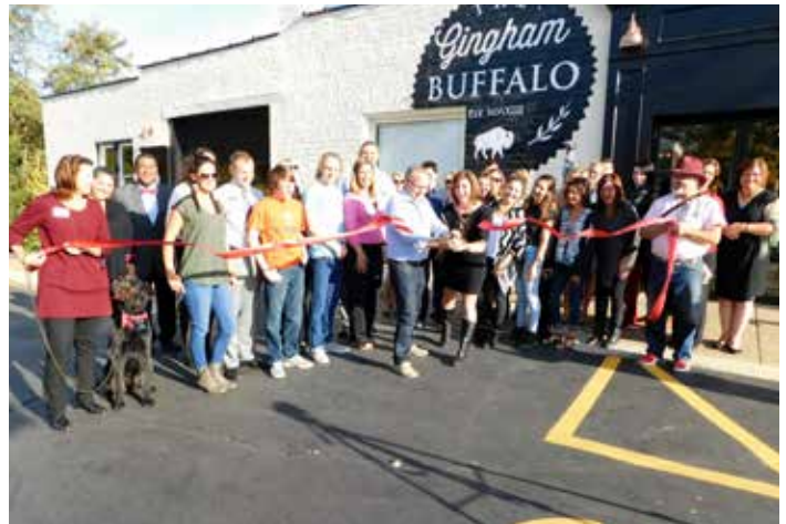
The Gingham Buffalo, October 20