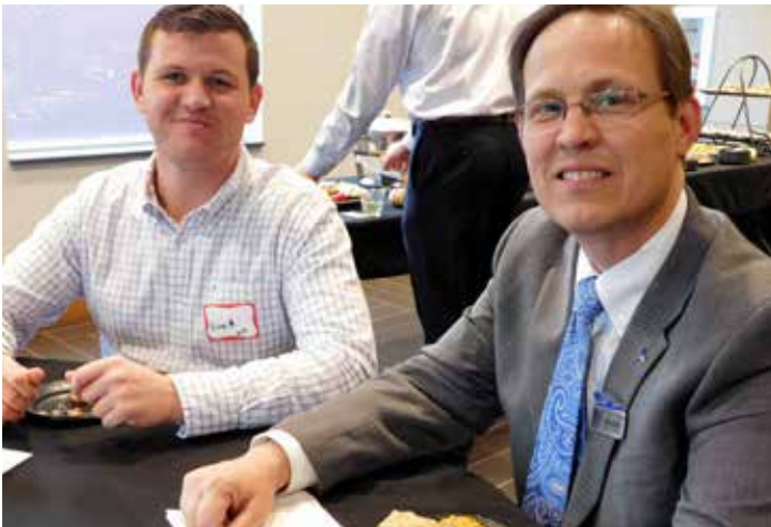
SIUE School of Business & SIUE Athletics, October 15