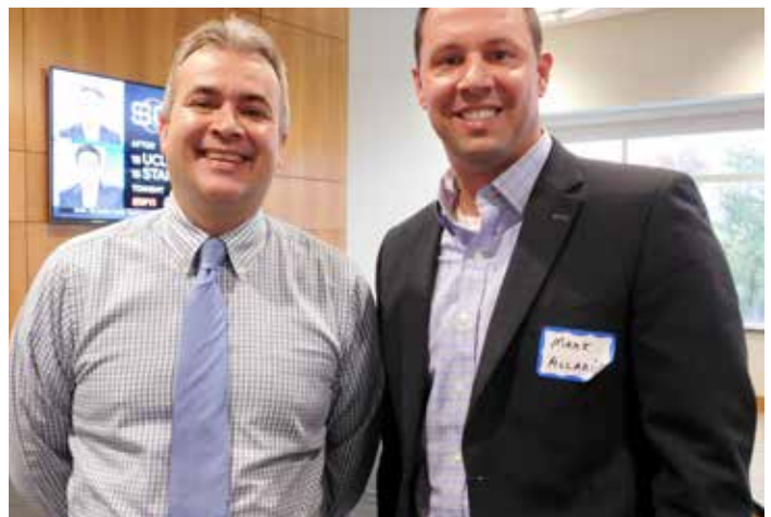
SIUE School of Business & SIUE Athletics, October 15