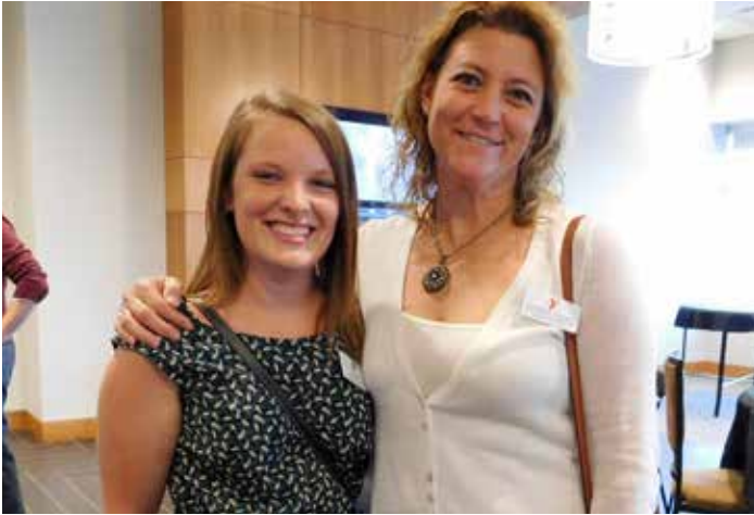
SIUE School of Business & SIUE Athletics, October 15