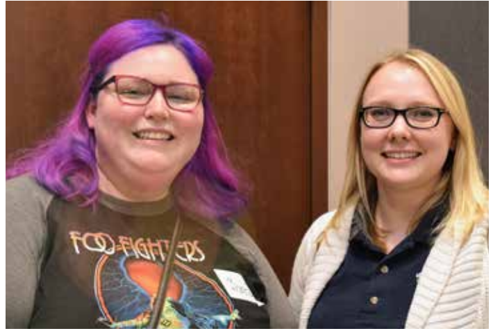
October 17: 1st MidAmerica Credit Union