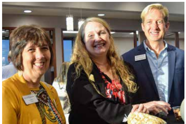
October 17: 1st MidAmerica Credit Union