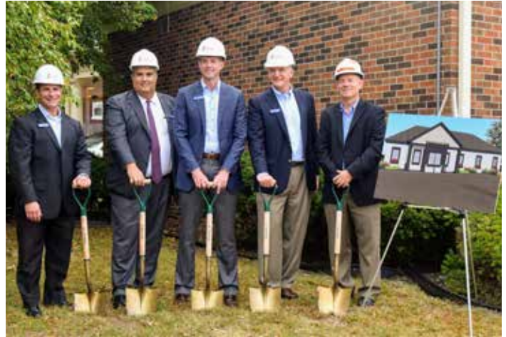
October 10: Edwardsville Bank, A Division of St. Louis Bank