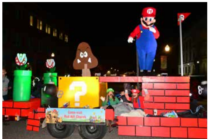
October 31: Halloween Parade Fan Favorite – Red Hill Church