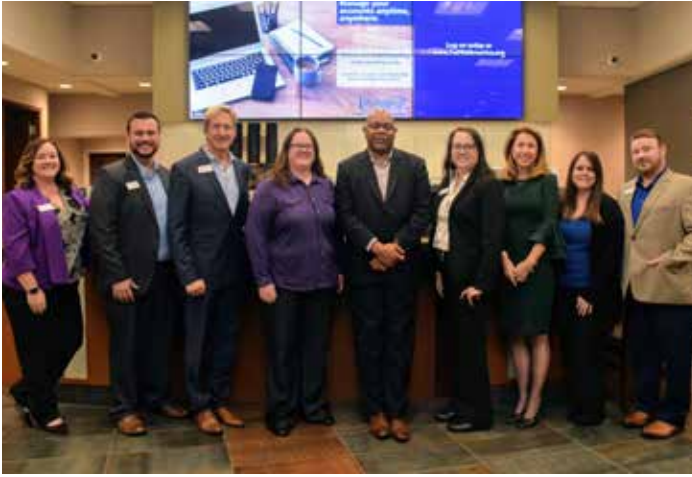
October 17: 1st MidAmerica Credit Union