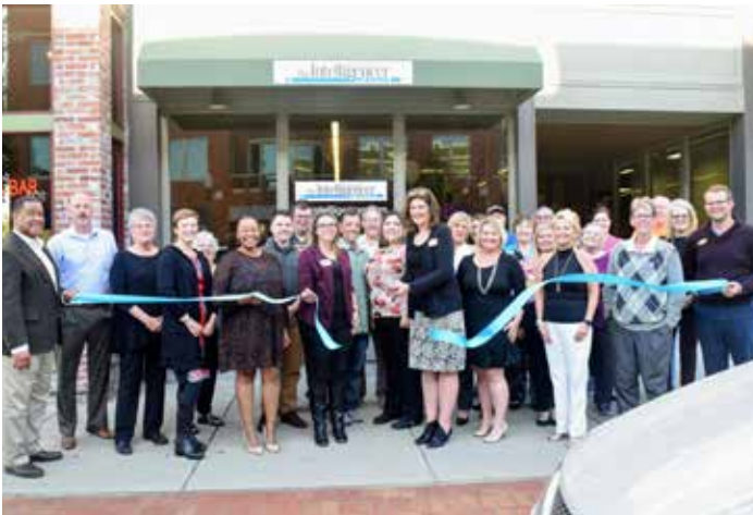
October 23: Edwardsville Intelligencer