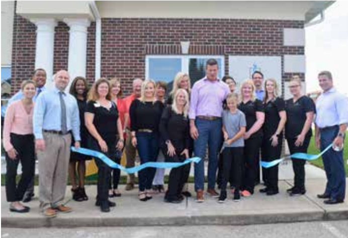
October 3: Infinite Wellness Integrative Medical Center