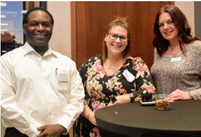
October 17: 1st MidAmerica Credit Union