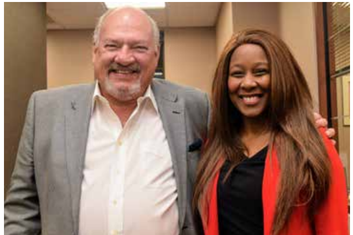
October 17: 1st MidAmerica Credit Union