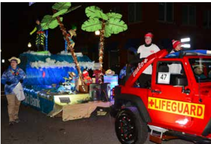
October 31: Halloween Parade Grand Champion – First Mid Bank & Trust