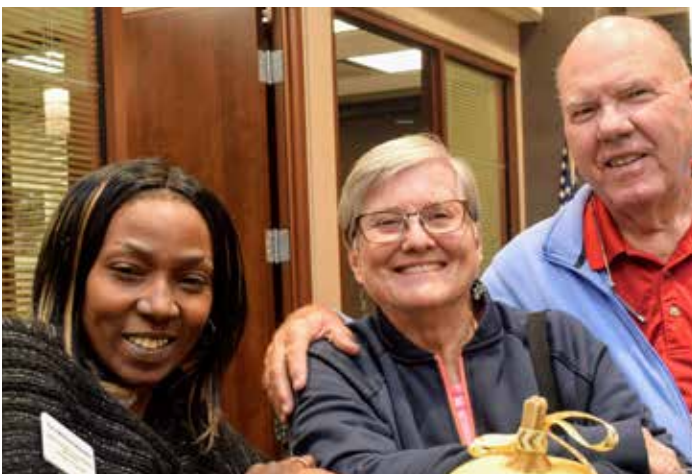
October 17: 1st MidAmerica Credit Union