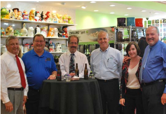
Chef's Shoppe, September 26