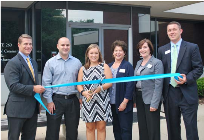
LifeVantage, September 18