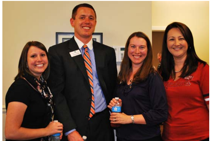
Extra Help, Inc., September 12