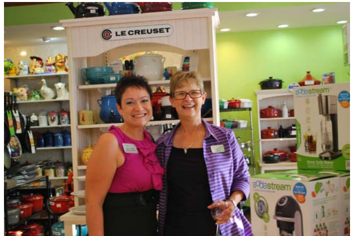
Chef's Shoppe, September 26