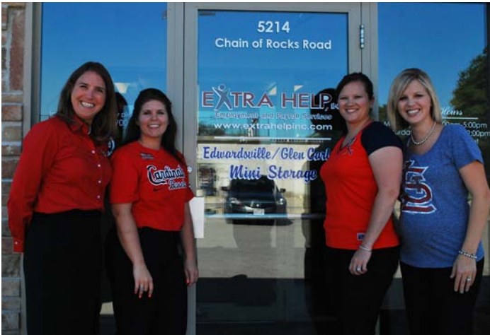
Extra Help, Inc., September 12