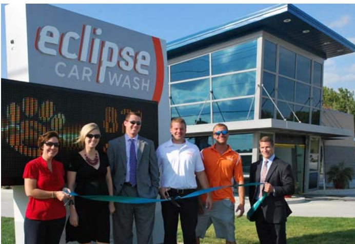
Eclipse Carwash, September 24