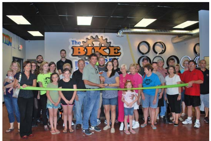
The Bike Factory, September 27