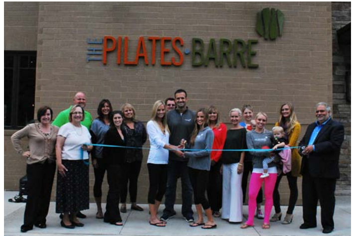
The Pilates Barre Studio, September 17