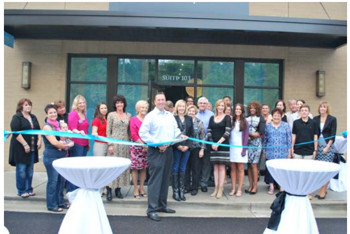
j.Blanquart Jewelry, Art & Accessories, September 20