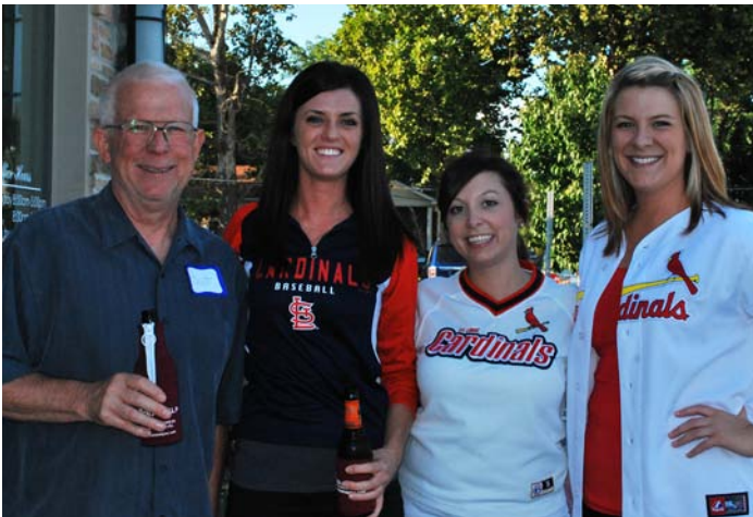
Extra Help, Inc., September 12