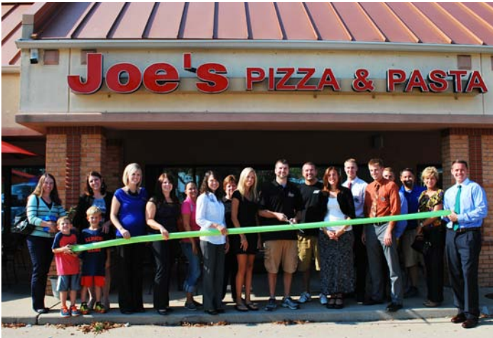
Joe's Pizza & Pasta, September 5