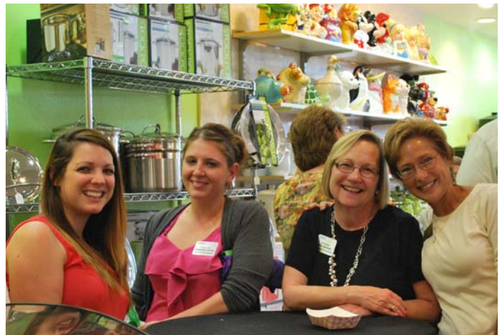
Chef's Shoppe, September 26