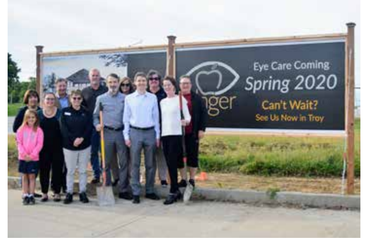
September 26: Unger Eye Care