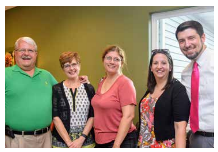
September 19: Lexow Financial Group