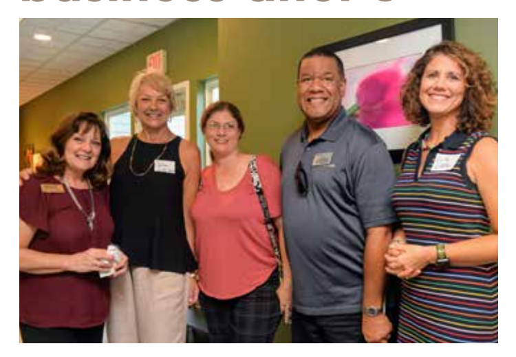
September 19: Lexow Financial Group