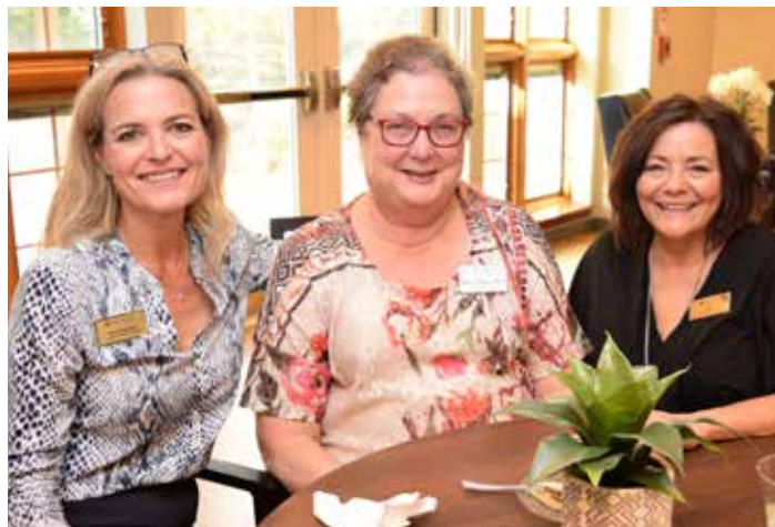
BA5 @ Ruthy's House by Cedarhurst Senior Living, August 17