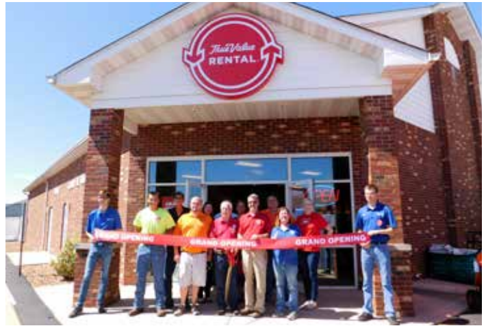
Ribbon Cutting @ True Value Rental, August 4