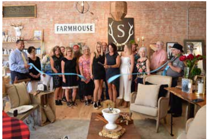
Ribbon Cutting @ Stix & Stones Interiors, August 24