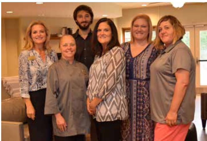
BA5 @ Ruthy's House by Cedarhurst Senior Living, August 17