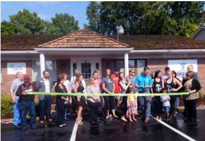
Ribbon Cutting @ Unfried Chiropractic & Wellness Center, August 10