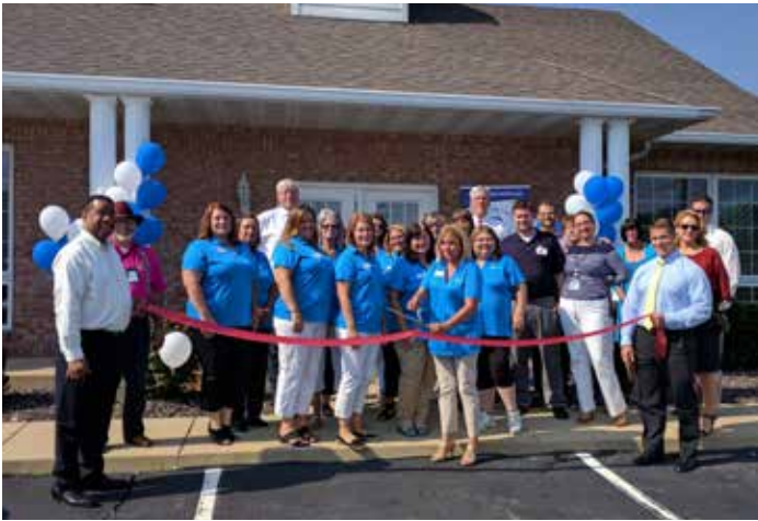
Ribbon Cutting @ Benchmark Title Company, August 2