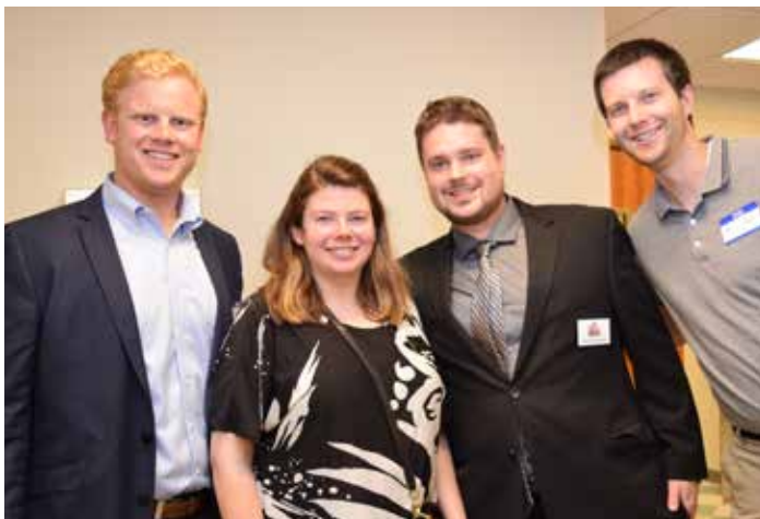
BA5 @ Ruthy's House by Cedarhurst Senior Living, August 17