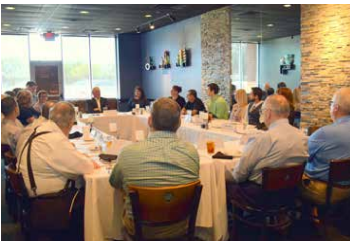
Business Roundtable w/ Congressman John Shimkus, August 24