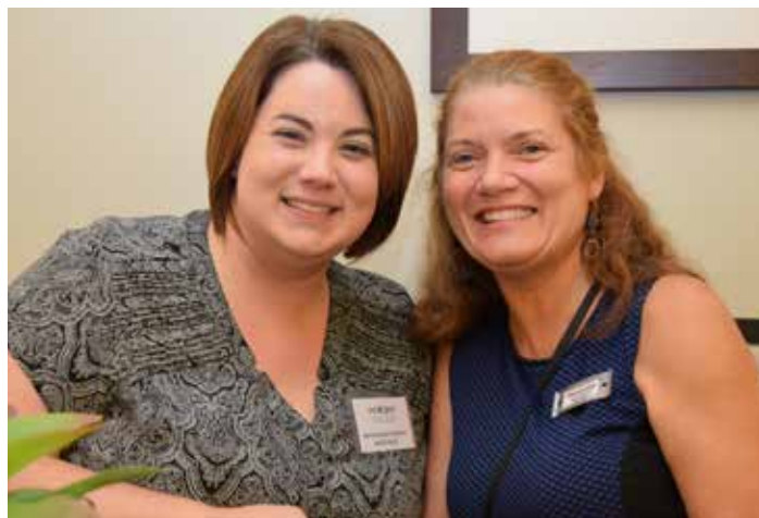
BA5 @ Ruthy's House by Cedarhurst Senior Living, August 17