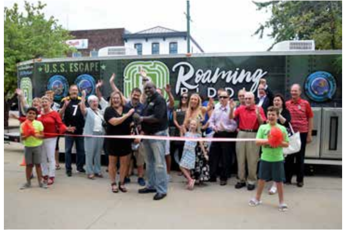
August 9: Roaming Riddle Mobile Escape Games