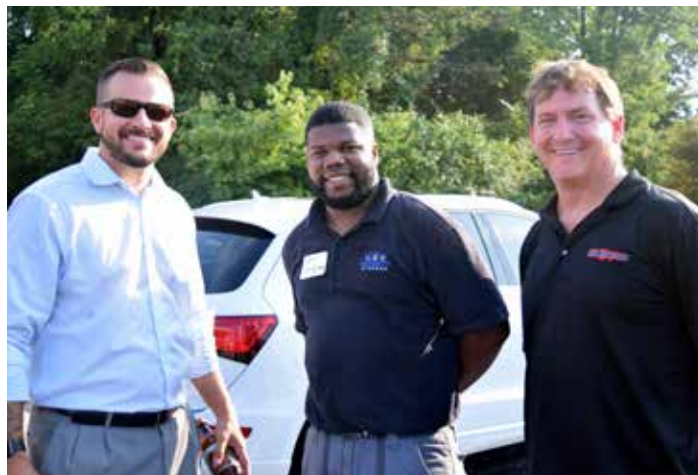
August 15: Kerber, Eck & Braeckel + EdGlenToday.com