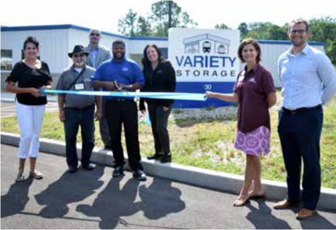
August 1: Variety Storage