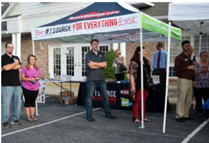
August 15: Kerber, Eck & Braeckel + EdGlenToday.com