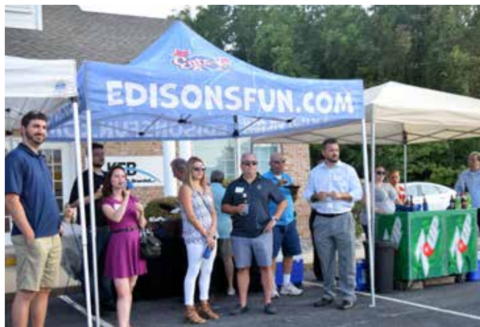
August 15