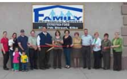
Family Resource Center