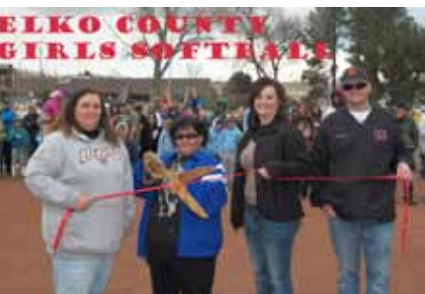
Elko County Girls Softball