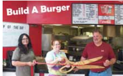
Build A Burger