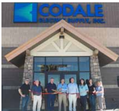
Codale Electric Supply, Inc.