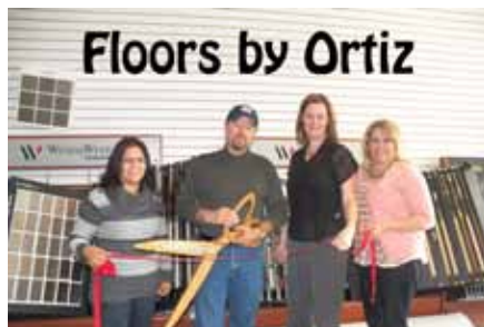
Floors by Ortiz