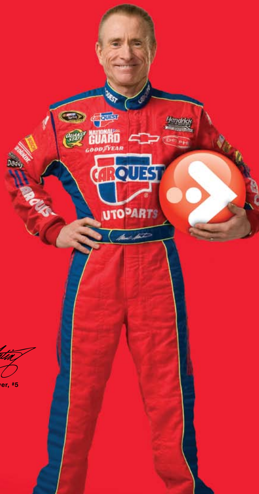
Mark Martin NASCAR Driver, #5