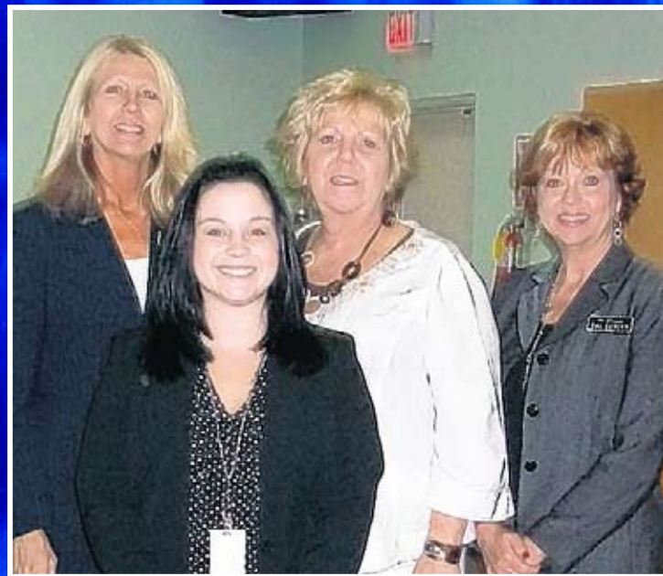
Luncheon sponsors: The Ledger Media Group