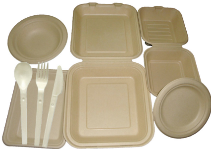
Compostable Plates, Containers, Cups, Utensils and Bags