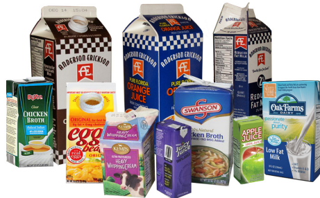
Paper Food Cartons (no caps) (not cylinder shaped)