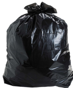
Garbage or Yard Debris