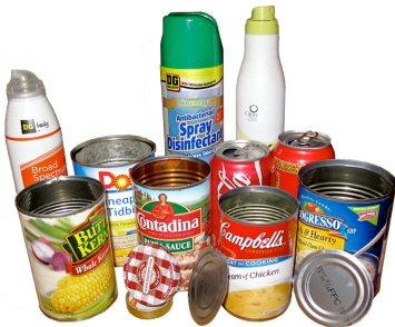
Aluminum, Tin and Empty Aerosol Cans