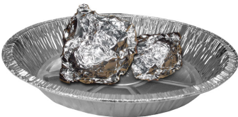
Baking Tins and Aluminum Foil