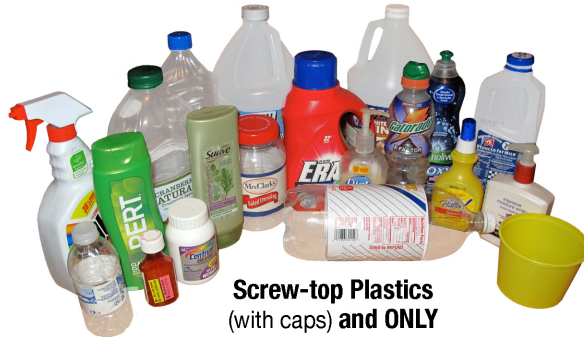
Screw-top Plastics (with caps) and ONLY Yogurt and Margarine Tub (NO LIDS)