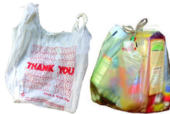
Plastic Bags or Recyclables in Plastic Bags