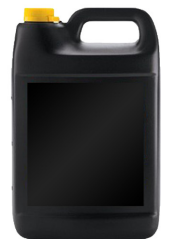
Containers for Hazardous Materials