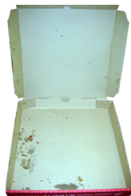
Food Contaminated Items (pizza boxes, paper plates, napkins, etc.)