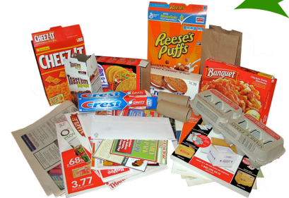
Newspaper, Glossy Inserts and Magazines, Mixed Paper (junk mail, phone books, envelopes) Cardboard (break down flat to fit inside or beside cart)