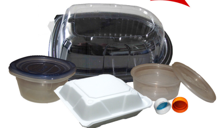
Plastic and Styrofoam Food Containers, Lids and Loose Caps