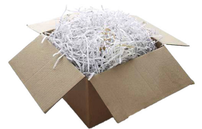
Shredded Paper (place in box or paper sack)