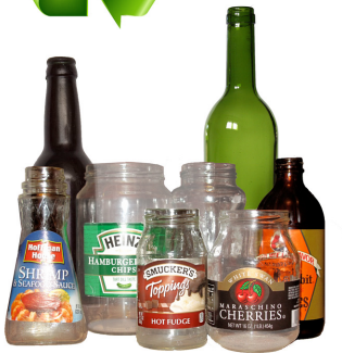
Glass Jars & Bottles (all colors)