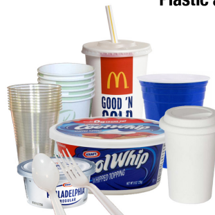
Plastic and Paper Cups, Tub, Lids and Utensils