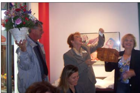
Ambassadors pull business cards to award door prizes at a monthly GMI.