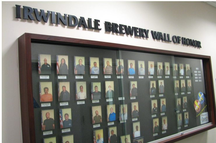
Celebrating our Veterans