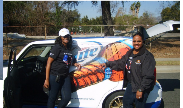
Pasadena Black History Parade

The MillerCoors Irwindale Brewery Employees proudly make a Difference in our Community!