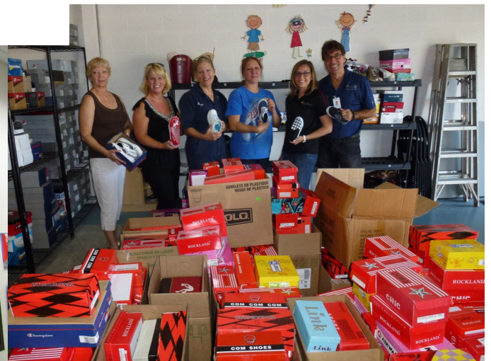
Shoes That Fit