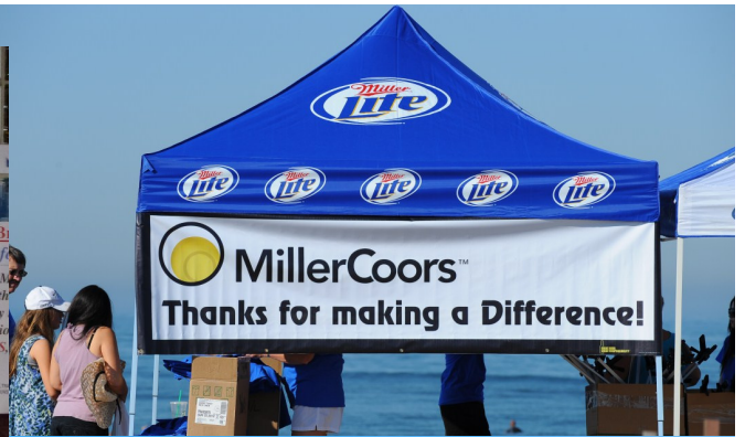
Water Stewardship—Beach Clean-up