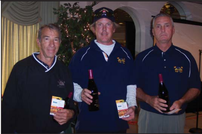
1st Place: Jan's Towing