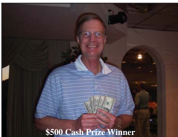
$500 Cash Prize Winner