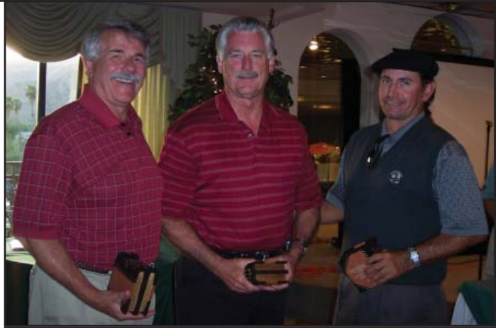
2nd Place: L & B Foods/McDonald's