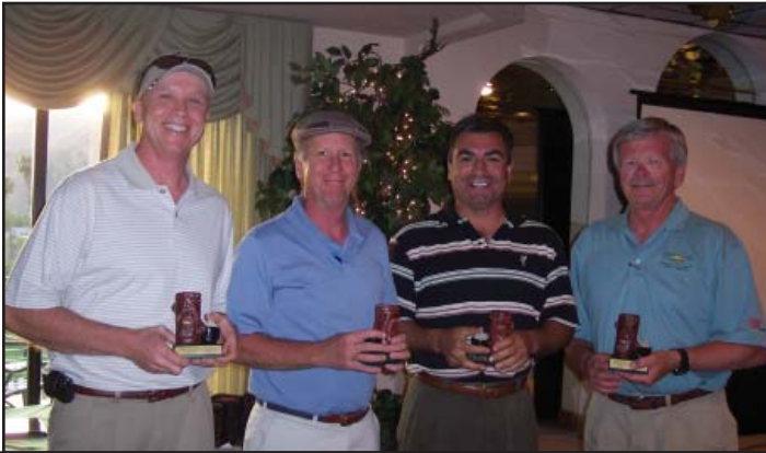
3rd Place: 1st Centennial Bank