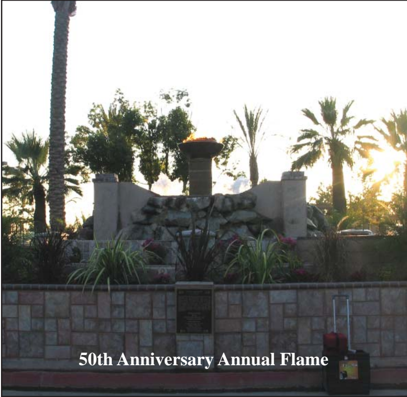
50th Anniversary Annual Flame