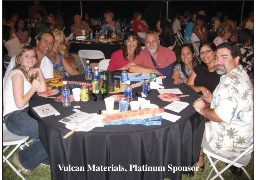
Vulcan Materials, Platinum Sponsor