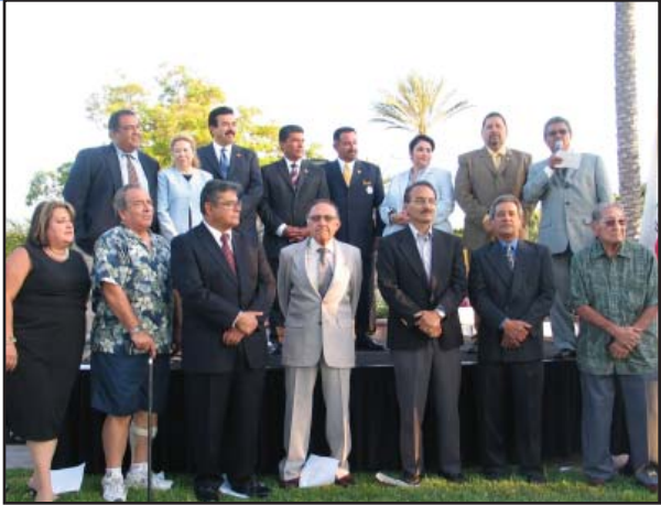
Past & Present Councilmembers