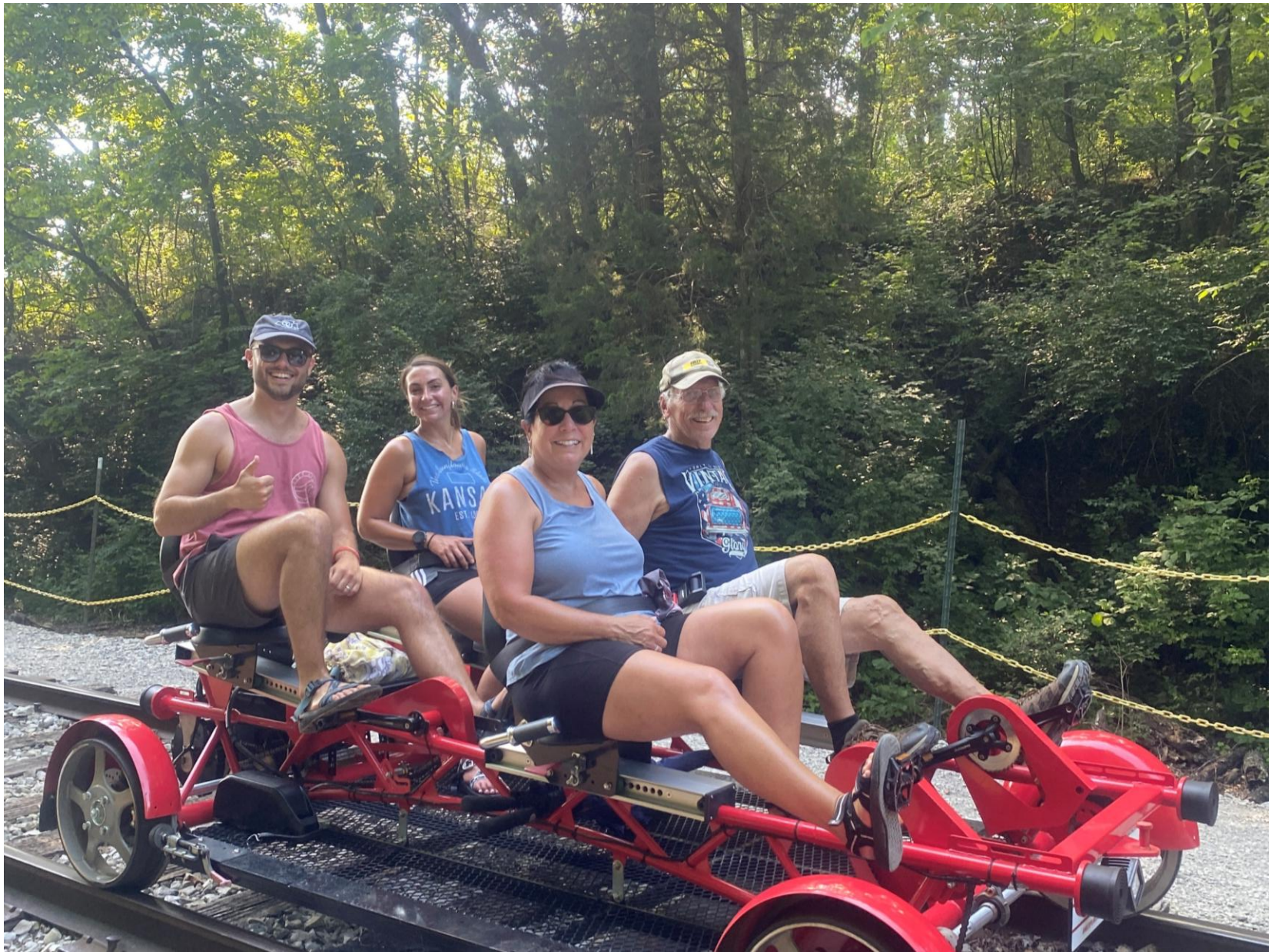
Participated in the nearby Railway Explorers