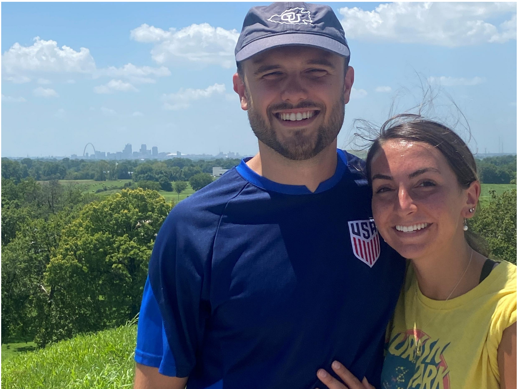
Visited the Cahokia Mounds State Historic Site outside of St. Louis on our way there