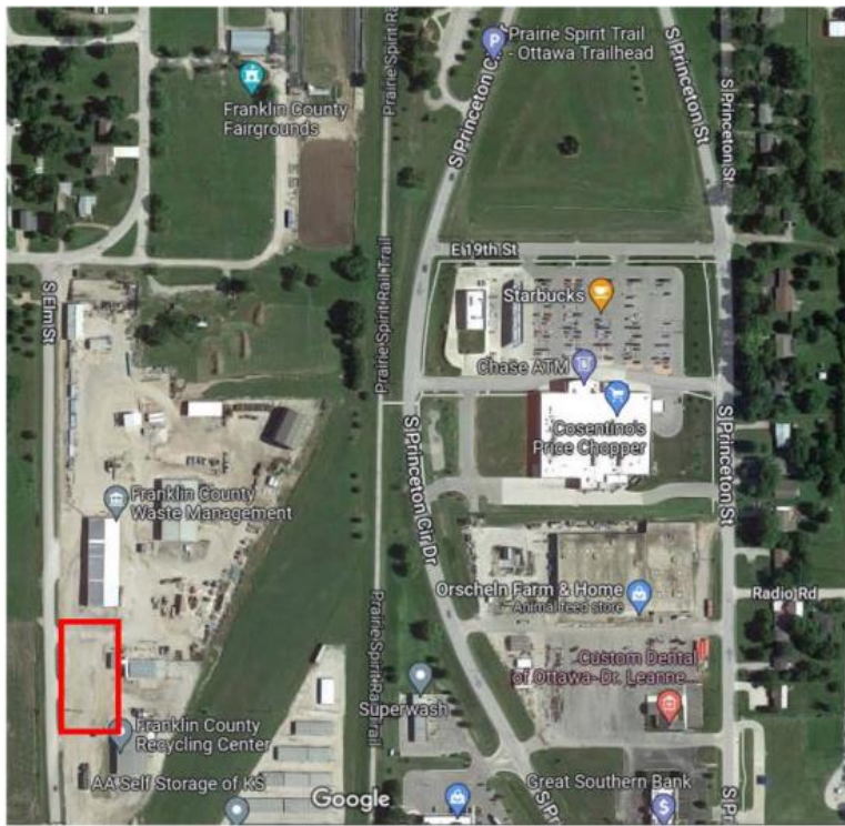
Near Fr Co Recycling Center (2000 Block Elm Street)