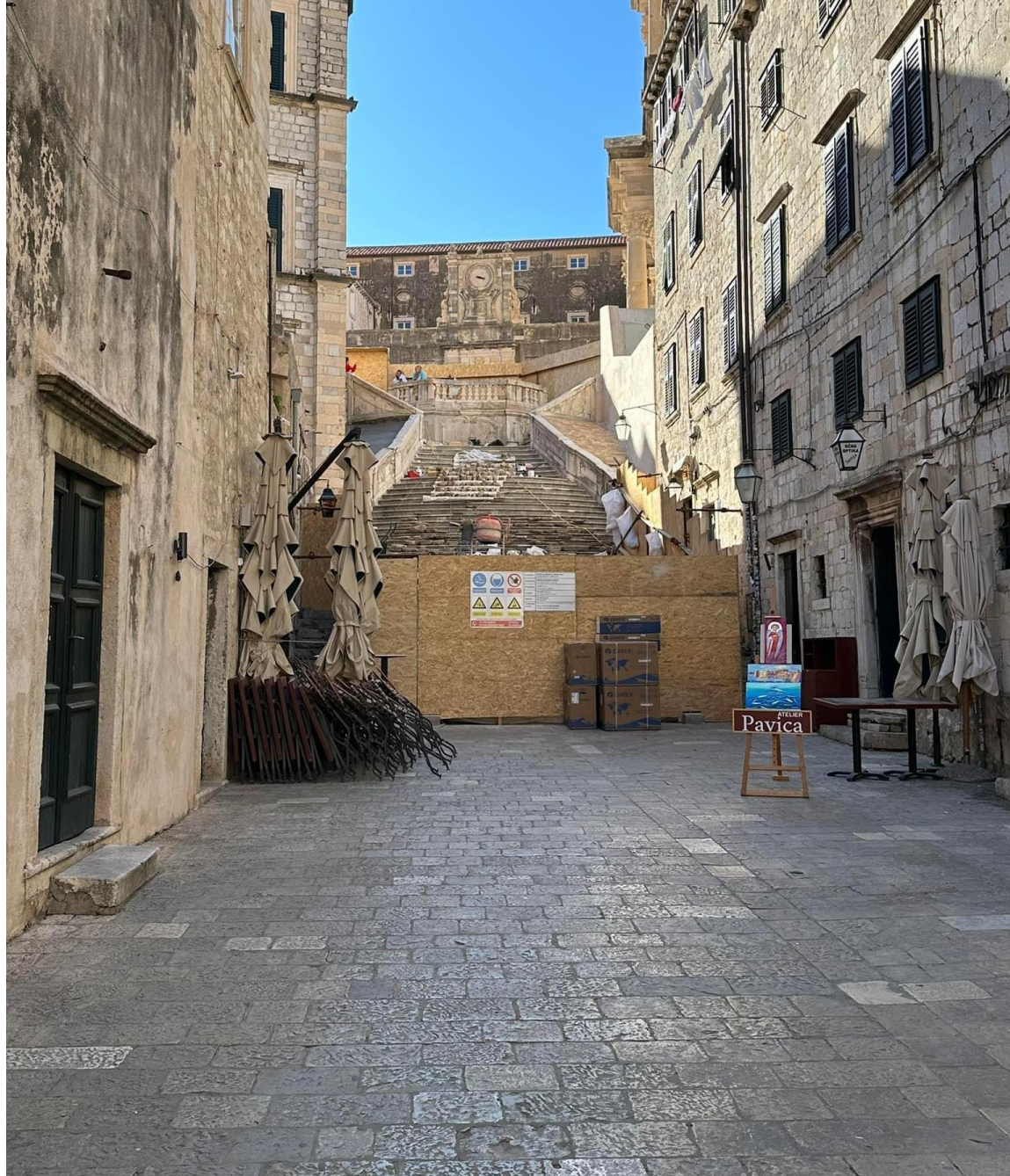
These are the steps that Cersei Lannister (Game of Thrones) walked down to start her walk of shame.