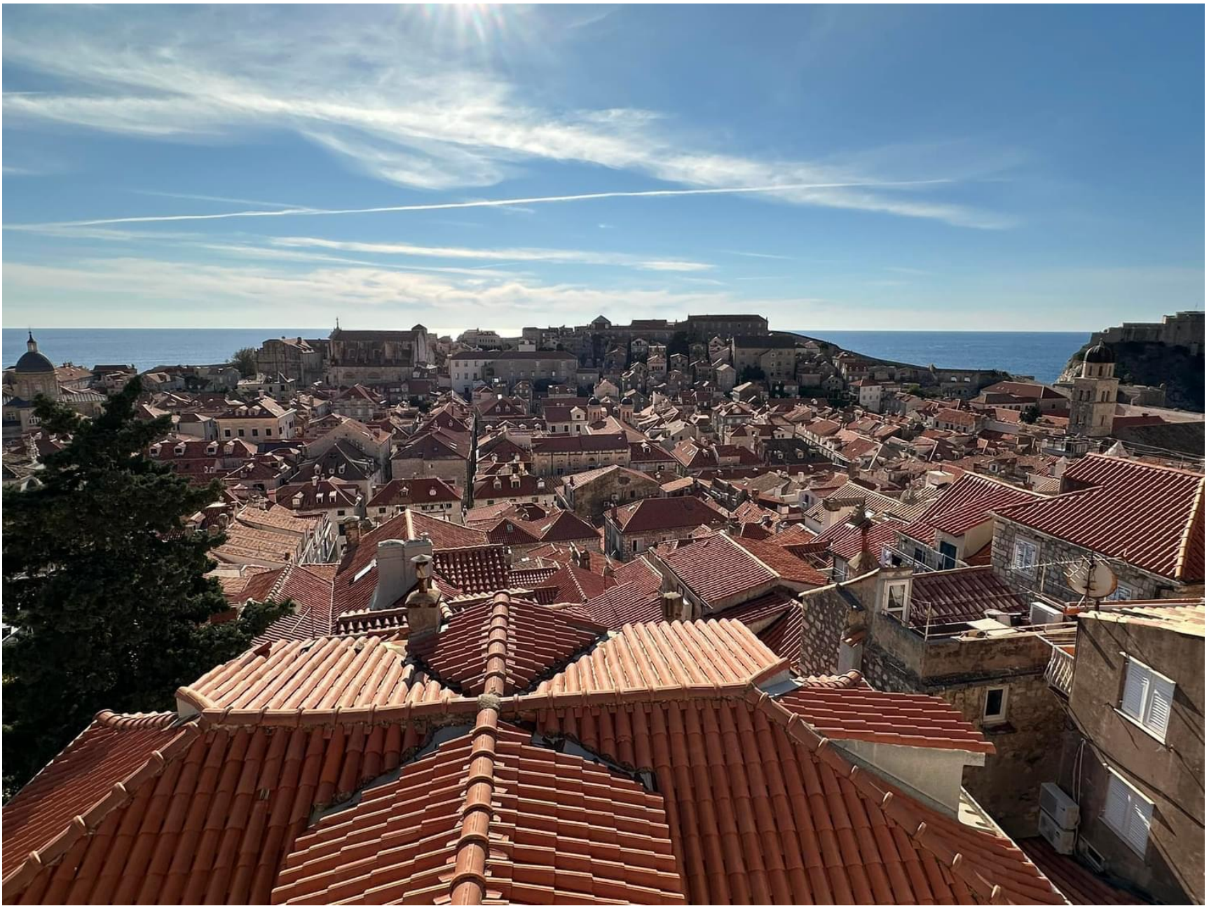
View of Dubrovnik