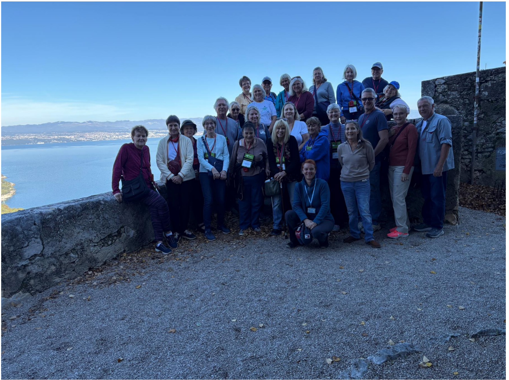
Group Photo in Moscenice