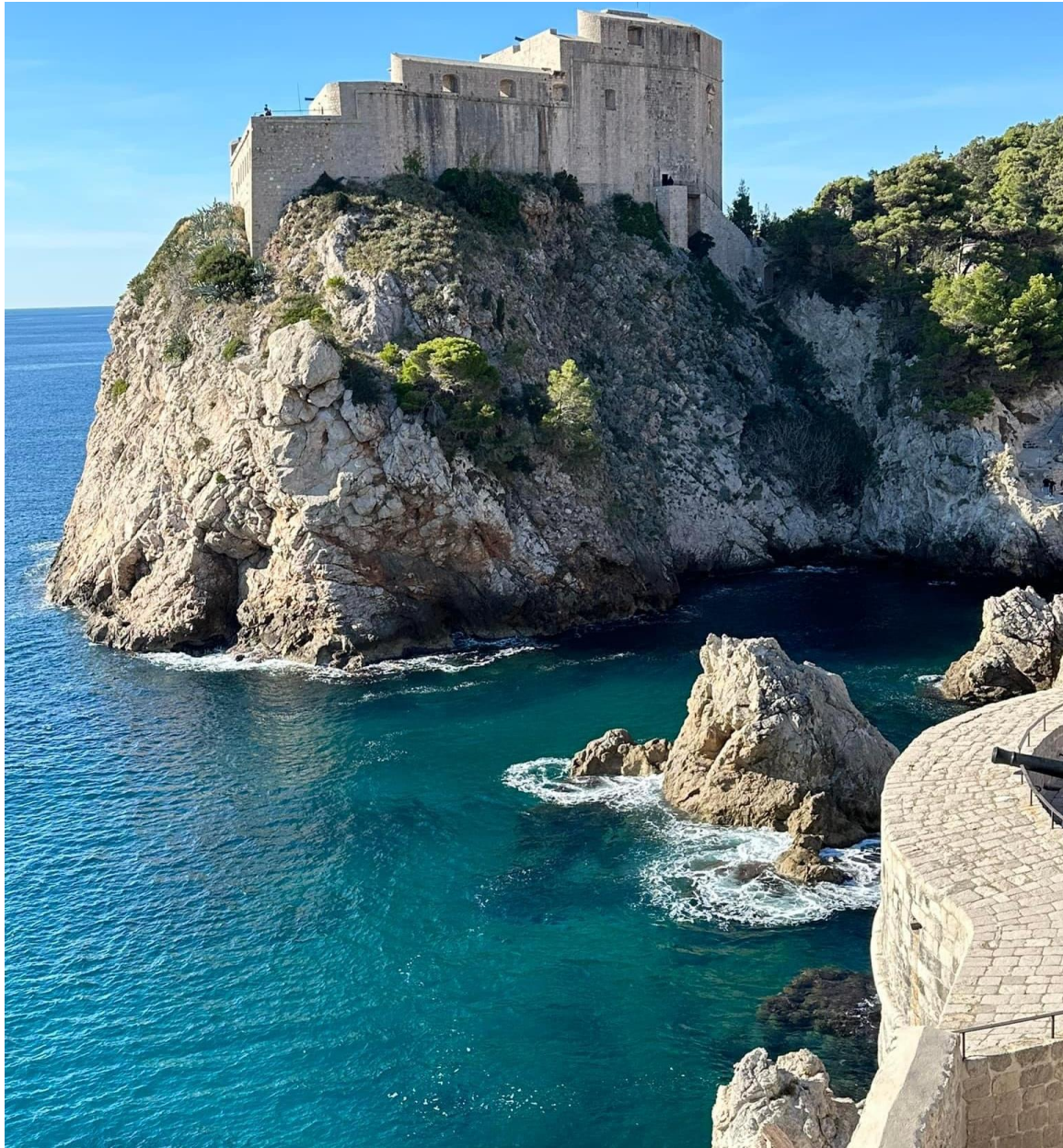
View from the city wall of Old Dubrovnik