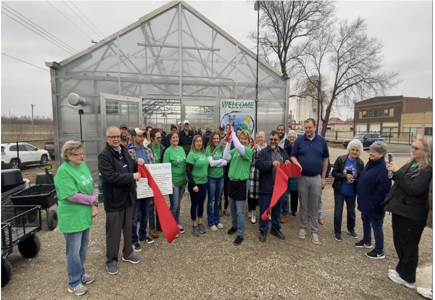
Wet Lilies is officially open!!