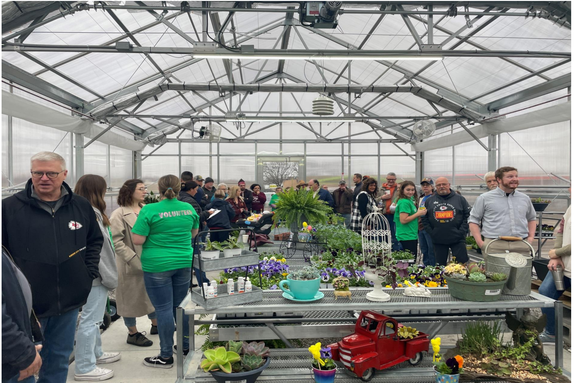
Big crowd attended this morning...