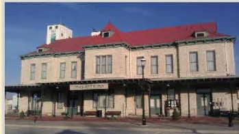
Old Museum Depot, Ottawa

Today, the Prairie Spirit Trail State Park connects to the Southwind Trail at Iola, and intersects the Flint Hills Trail (Osawatomie to Herington) to the north at Ottawa.