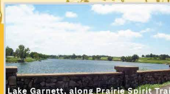
Lake Garnett, along Prairie Spirit Trail