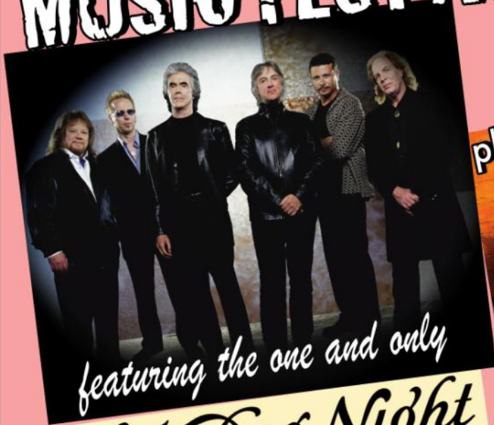
featuring the one and only

Plus 17 local rock and pop bands on 3 stages!