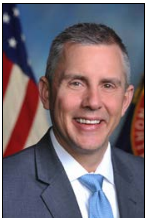
Governor Kelly Armstrong