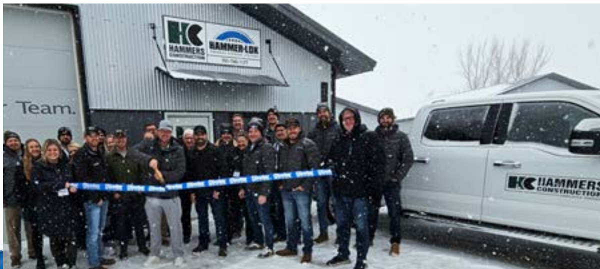
Pictured are Hammers Construction employees, guests and The Chamber Ambassadors.

2813 Heartland Business Court, Grand Forks, ND