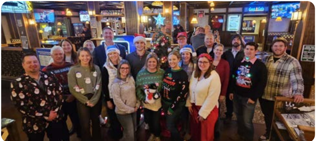
Pictured The Chamber Ambassadors enjoying their annual Christmas Social at Tavern United.

The Ambassadors meet on the 3rd Monday of the month.