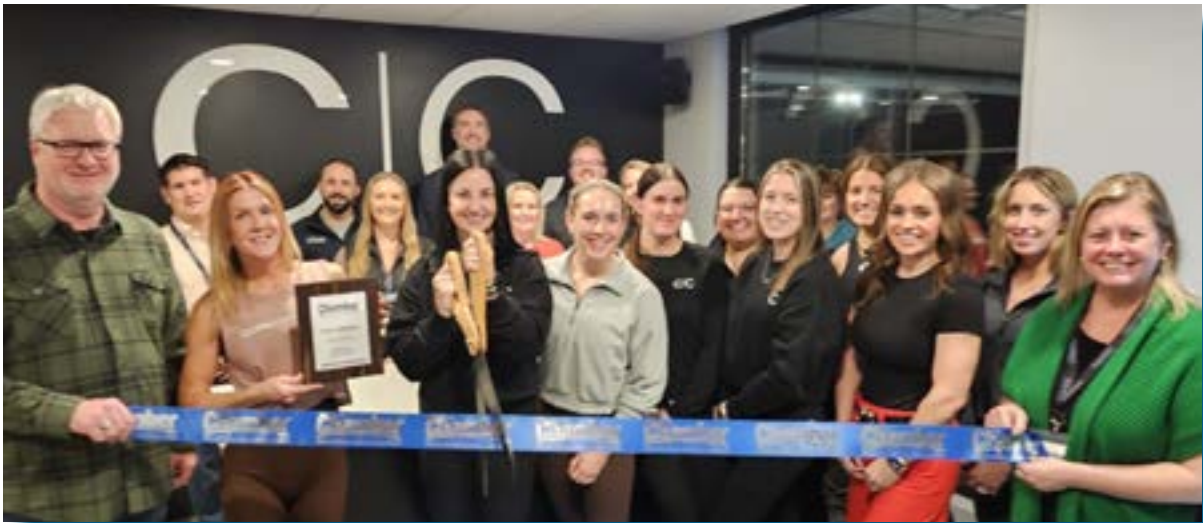
Pictured are Core Collective employees, guests and The Chamber Ambassadors.

214 N 4th St (In Franklin on 4th), Grand Forks, ND