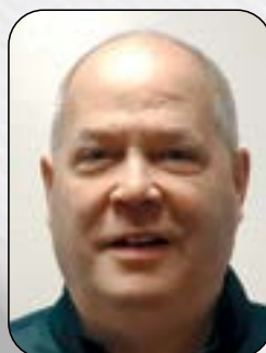
Tarek Howard Auto Finance Super Center