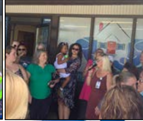
All Embracing Home Care