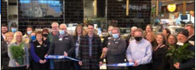
Hugo's Pure Market

The Chamber Ambassadors would love to meet you and celebrate your business with a ribbon cutting ceremony.