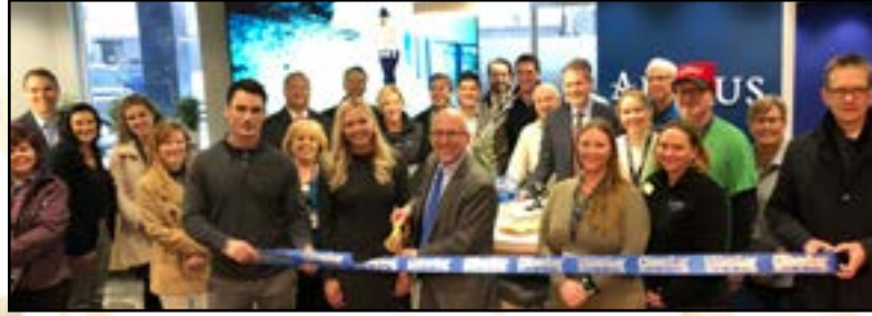
Alerus Downtown - Hugos