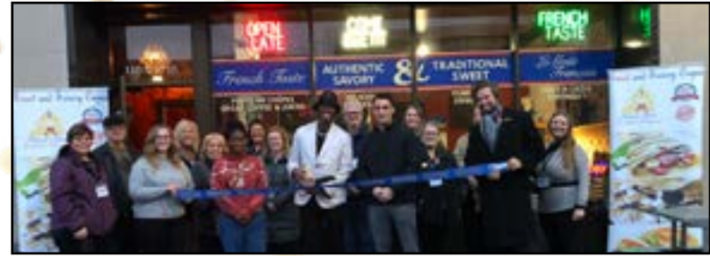
French Taste - Downtown