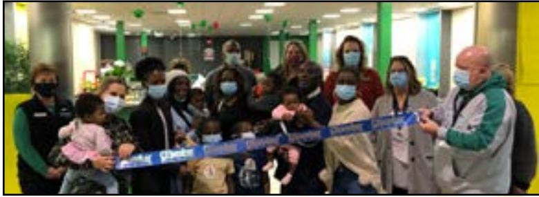
Academy of Kids Childcare Center