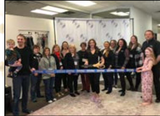
Affairs by Brittany