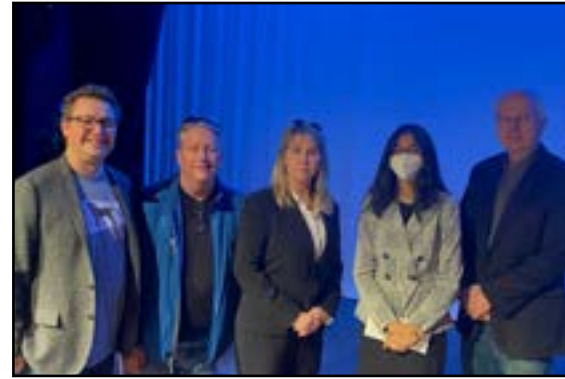
First Place - Brace Cap LLC