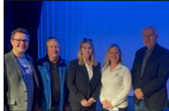
Second Place - Money Golf