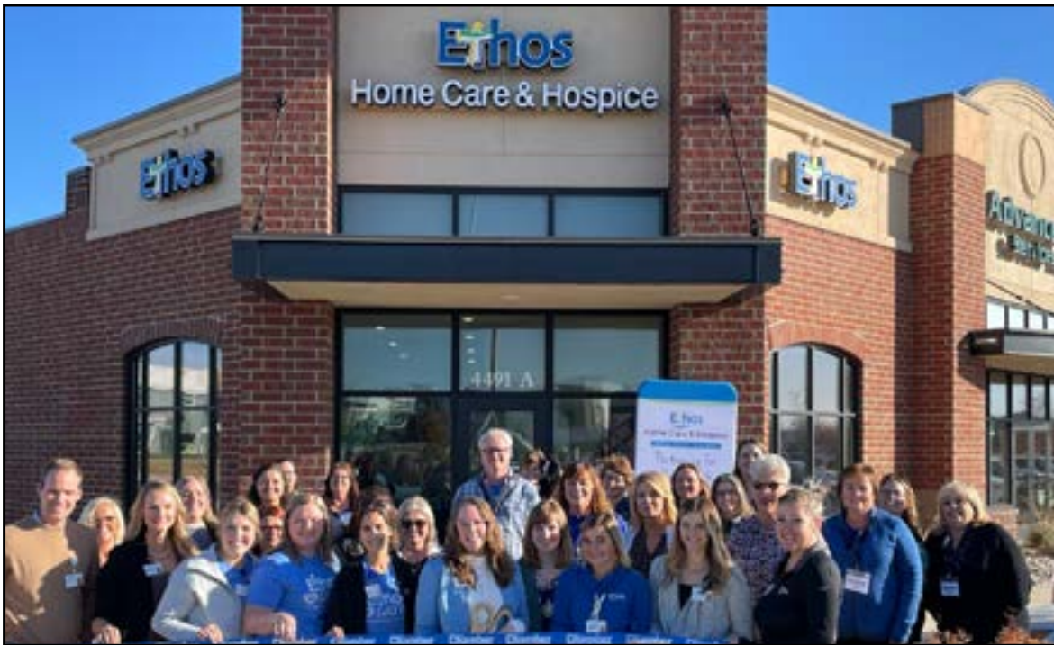
Ethos Home Care & Hospice