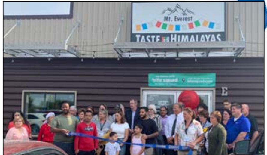
Mt. Everest 8848