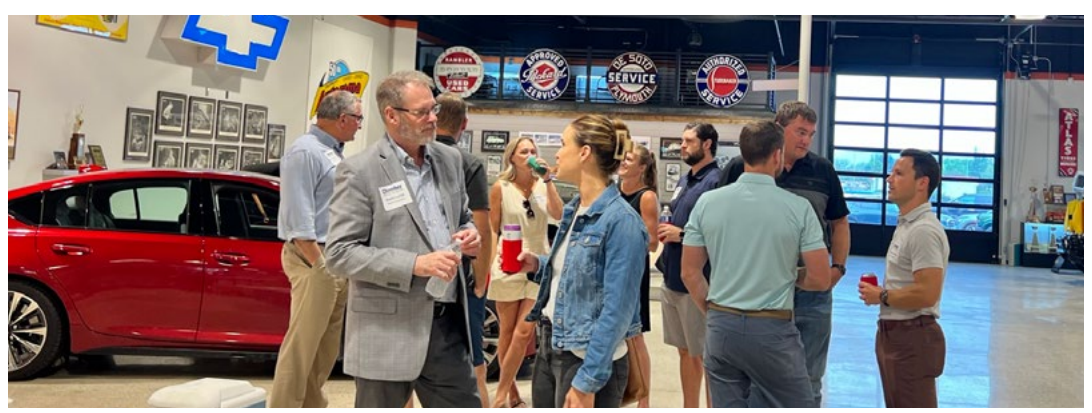
Pictured above are members of The Chamber Board and Committee Chairs.